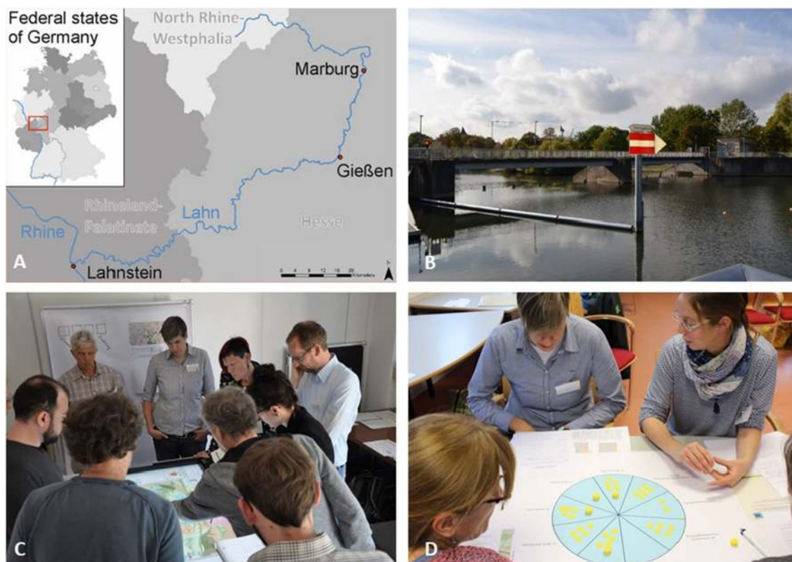
Fig. 2 Location of the Lahn River landscape (a), Lahn River and technical infrastructure (b), and impressions from the LahnLab Workshop Series, depicting a Geodesign-workshop using a touch table and spatial decision support tools (c) and a weighing task as part of a participatory multi-criteria analysis (d)

(county), state (Hesse and Rhineland-Palatinate), and national level.