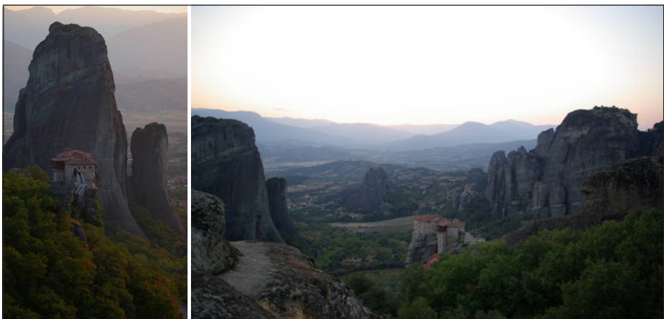
Fig. 4. The geological formations of Meteora (mixed UNESCO site)

Indeed, efforts made even by the first Urban Plan ensured that extension of Kalambaka city would take place on the opposite side of the monument area, as well as that building densities in the districts found in the proximity of the monument would remain lower than those in other parts of the city. Initial Urban Plan however, regulated only the strict area of the city of Kalambaka. That means that for a long time rural space and natural areas in the surroundings were left without planning regulations; therefore building activity in many cases proved a negative factor for the monument and its landscape. At the same time, urban regulations failed to protect architectural features of Kalambaka city, which is considered to be the reception pole and the gate towards the UNESCO site.