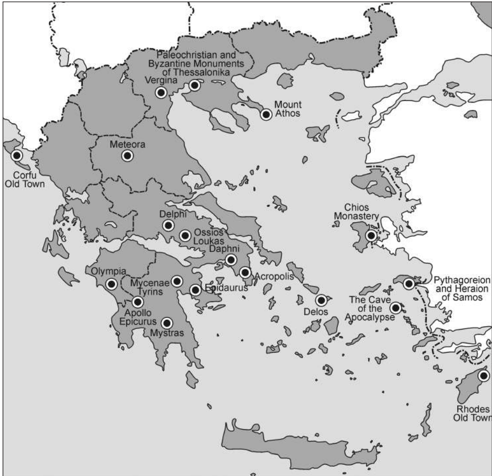
Fig. 1. The UNESCO sites of Greece