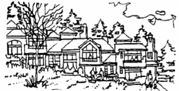
FIGURE 5- CLUSTERED HOUSING ENHANCES NEIGHBORLY INTERACTION