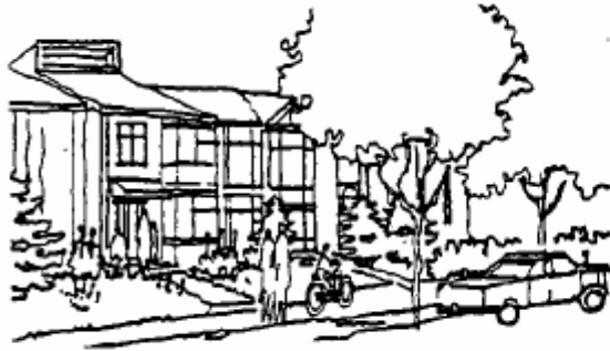
FIGURE.4 - FRIENDLY & SAFER HOUSING WITH PERSONALIZED PUBLIC & PRIVATE AREAS

Well developed residential clusters have the opportunity to share social amenities and open spaces. Orienting dwelling units to the South can enhance comfort and save energy.