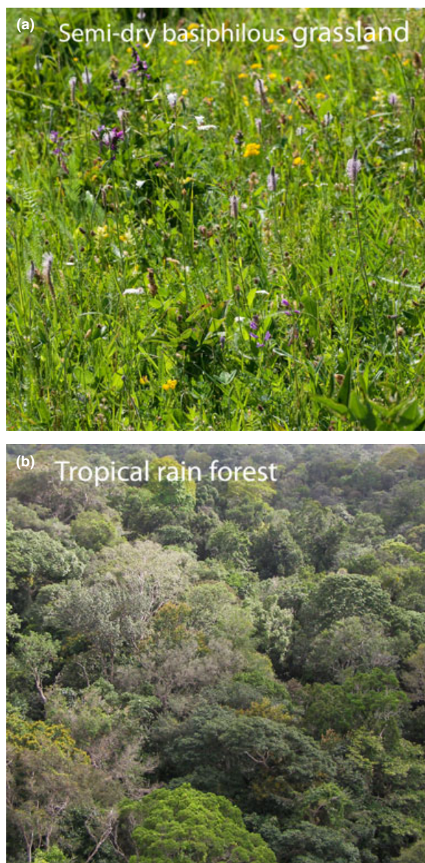
Fig. 1. High-richness community types: (a) Semi-dry basiphilous grassland near Cluj-Napoca, Romania, the site that holds the global richness record at the 0.1- and 10-m 2 scales, and (b) Tropical rain forest in French Guiana, the vegetation type that holds the global richness record at the 100–10 000-m 2 scales.

species–area relations recorded with the shoot presence inevitably have a lower limit. For example, in the study of Dengler et al. (2004) the 9-mm 2 quadrat completely covered the three species hit. The nested 1-mm 2 quadrat therefore also contained three species (Table 1), and a point would also have hit these three. Point quadrat richness is difficult to obtain from the literature because results