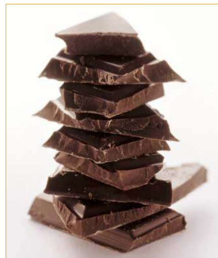
Figure 1 Stack of benefits? Unlike its milky counterpart, dark chocolate may provide more than just a treat for the tastebuds.

Addition of milk, either during ingestion or in the manufacturing process, therefore inhibits the in vivo antioxidant activity of chocolate and the absorption into the bloodstream of (–)epicatechin. This inhibition