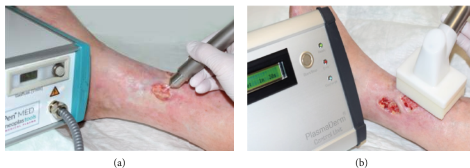
FIGURE 2: Treatment of chronic ulceration with cold atmospheric pressure plasma (CAP): (a) kINPen MED and (b) PlasmaDerm VU-2010.