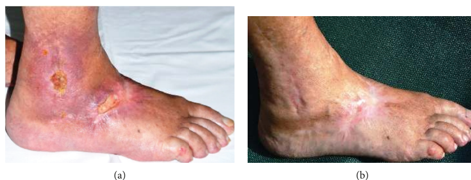
FIGURE 3: Example of successful wound healing after treatment with cold atmospheric pressure plasma (CAP): (a) chronic ulceration before CAP treatment and (b) complete healing for the first time since 14 years after CAP treatment for about 5 months.