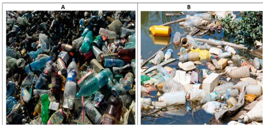
Fig. 2 Images of plastic pollution on both terrestrial and aquatic environment. (a) Dump site showing plastic pollution. (b) Plastic pollution of marine environment.