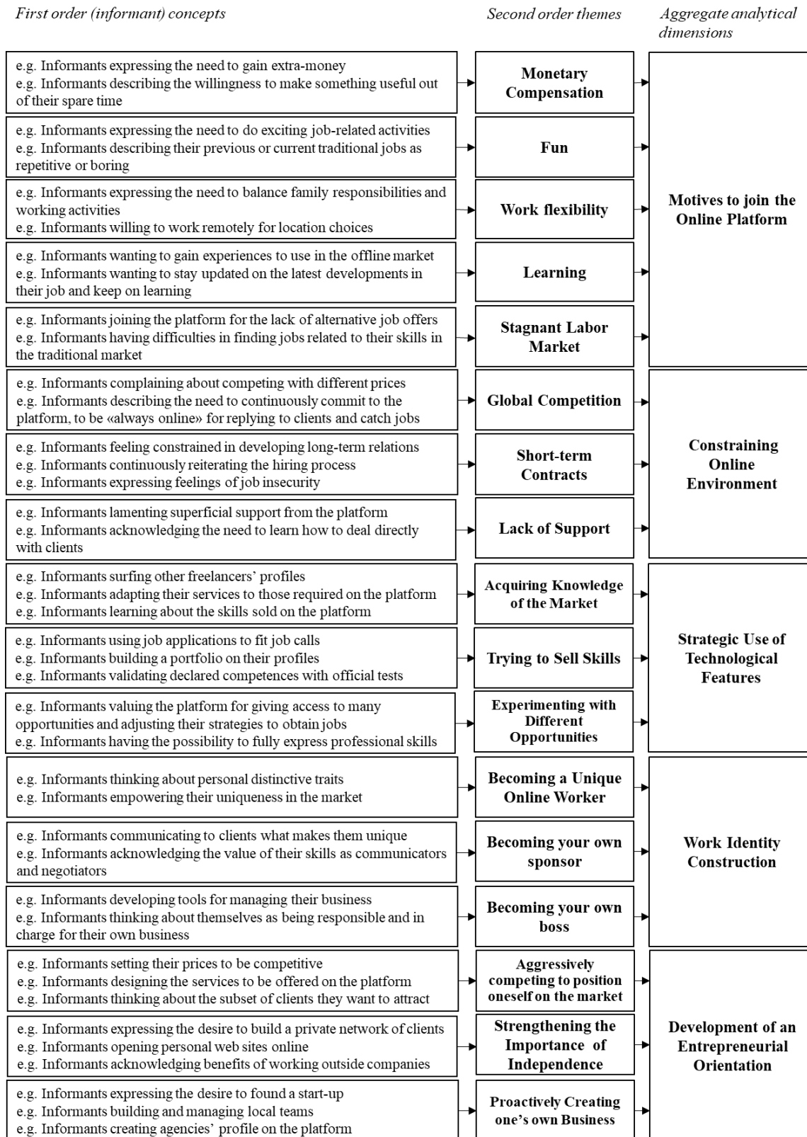
Figure 1. Data structure