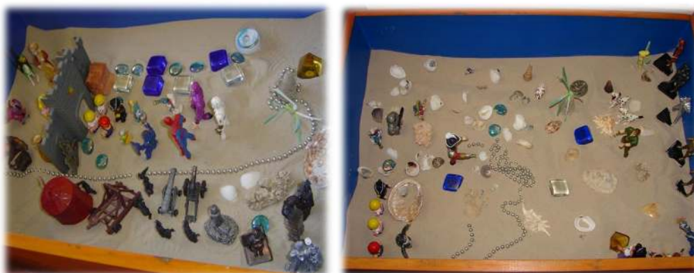
Figures 3 & 4. The rise of the hero figure

The seventh session saw the emergence of hero figures in the battle lines. Around this time teachers began to report that he seemed much happier in class and was cooperating with the teacher but still had problems with other children.