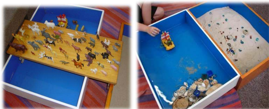
Figures 5 & 6. Organised play with deeper meaning.

personal view of the world became more organised he may have felt more in control, more able to manipulate the symbols and the sand to achieve a result with which he was satisfied.