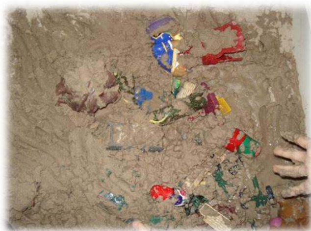
Figure1. Early chaotic play

In the first three sessions, the boy was encouraged to play in a Sandtray. The photograph (Figure 1) depicts what was common in his play: disorganisation, chaos and a lack of order.