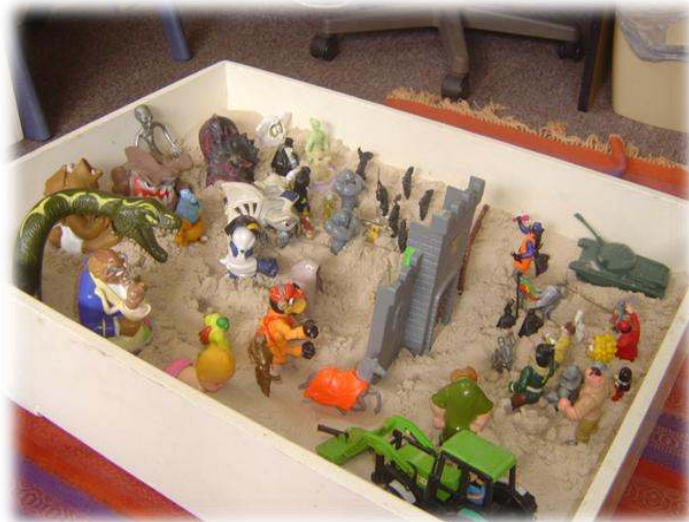
Figure 2. Battles

In Session 4 the client experimented with a number of symbols, did not ask for water and selected common symbols from a range of symbols that depicted television characters such as Gumby and some superheros. By the fifth session some order was evident in the play and the young boy began regular play each week that involved battles sometimes between animals, sometimes animals against forest clearers, and sometimes between characters trying to storm a castle. The play usually started as disorganised affairs and usually resulted in a chaotic victory by one side but gradually by week seven evolved into more of a strategic set of manoeuvres that showed a clear strategy and a clear victor.