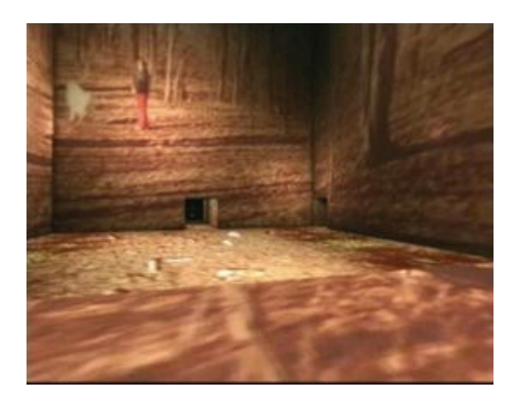
Figure 1: Screen capture from [domestic], Flanagan, 2003.

There is a current surge of interest in documentary game works, including works that can loosely be described as biographical, such as Super Columbine Massacre RPG! or Waco Resurrection . In an already limited field of nonfiction digital games, autobiographic works are even more rare. This paper uses two game-based artworks by Mary Flanagan (primarily [domestic] and to a lesser extent [rootings] ), to examine autobiography in the form of digital games. Specifically, it explores the ways in which these games construct/represent subjectivity, how the game form structures self-narrative, and how such games negotiate agency (both within the work and within the realm of cultural production). This analysis reveals both the structural challenges and representational affordances of autobiographic games.