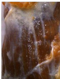
Figure 3: The dorsum aspect of sternocleidomastoid muscle.

In the neck muscles, the dorsum aspect of sternocleidomastoid muscle depicted this finding most frequently (Figure 3). Pneumomediastinum was prominent in midline mediastinal soft tissues (Figure 4).