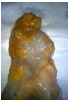
Figure 4: Pneumomediastinum in midline mediastinal soft tissues.

Furthermore the evidence of emphysema could be well appreciated during autopsy from the crackling sound under the dissection knife. The autopsy did not reveal any mucosal lesions of either the upper or lower airways. All the findings were noted and photographed in situ as well as after separating them from their anatomical attachments.