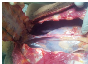
Figure 5: Dissection of the neck and chest.

Evidence of any cardiopulmonary pathology was ruled out from gross and microscopic histopathological examination. Layer-wise and careful dissection of the neck and chest did not reveal any evidence of pneumomediastinum (Figure 5), CSTE (Figure 6) or air bubbles around mark of strangulation (Figure 7).