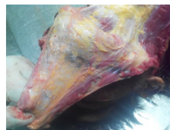
Figure 7: Air bubbles around mark of strangulation.

CSTE and pneumomediastinum was recorded in three control cases (10%); two cases of acute LVF and one case of hypertensive cerebral hemorrhage. However it was neither too gross nor present as a continuous stream. A patchy, irregular and focal distribution of separate tiny air bubbles was present at multiple foci in all three cases, which could be easily differentiated from continuous streaming emphysema found in hangings.