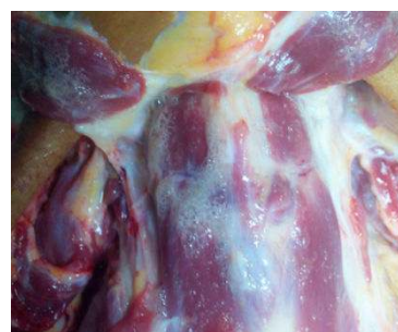
Figure 2: Air bubbles at the clavicles near the root of the neck and on the dorsal surface of upper layer strap muscles and ventral surface of deep strap muscles.

A further evaluation for the specific location of emphysema showed that CSTE and pneumomediastinum occur as coexistent findings, as none of the cases revealed these as independent findings which also suggest the presence of a pressure gradient between ruptured alveoli and the upper respiratory tract. A correlation of the phenomenon was made with Simon's bleeding (13/30 positive 43.3%) and clavicular periosteal hemorrhage (18/30 positive-60%) at the sternocleidomastoid muscle origin.