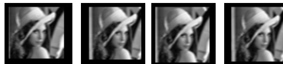
of LR images used to estimate the high resolution image.