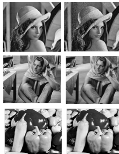
Figure 2. Column (a) shows the original images and column, Column (b) shows the reconstructed images using proposed algorithm for Lena, Barbara and Peppers .