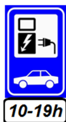
Figure 2 Street sign to indicate that parking spot is exclusively reserved for charging vehicles between 10:00 and 19:00

With regard to the effects on charging behaviour, it is expected that this policy will increase the difficulty of EV drivers to access charging stations after 19:00 as non-EV users can also park at these spots making. Occupation of the charging station is therefore expected to be lower in the hours beyond 19:00 at charging stations with the daytime charging policy implemented. Should this be the case, the policy has the intended effect of relieving parking pressure in the area surrounding the charging station. As a second-order effect on purchase intentions, it is assumed that the daytime restriction will reduce the purchase intention for EVs, since home charging availability is an important factor in EV adoption (Carley et al., 2013). Hence, if uncertainty arises about availability because of the daytime charging policy, this could reduce EV purchase intention.