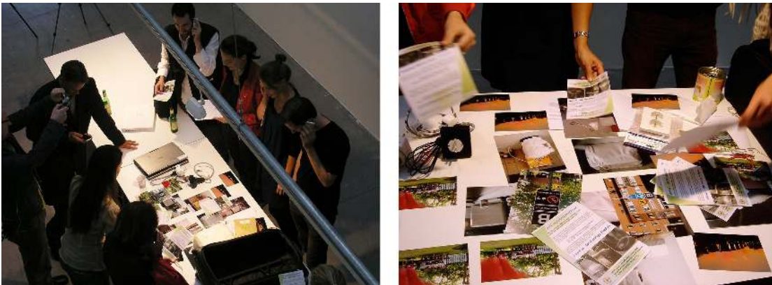
Figure 3. Over the course of the public Energy Futures event, the contents of a closed case take over the space, unpacked, debated and arranged by participants as the superfictive narratives unfold

We then generated five ‘(super)fictive realities’ or ‘superfictions’ (Figure 2). These were articulated through collections of highly-considered and -crafted artifacts and media (e.g. “conceptual modelling”, see Seago & Dunne, 1999), including mock-ups and working prototypes, family-snapshot and journalistic photos, Wikipedia and YouTube media. Each superfiction was accompanied by a carefully-crafted narrative written in the first person as if from the future. Rather than one-liners (typical in concept and critical design), these blur between sci-fi and oral history, personal anecdote and reportage, to develop qualities that are nuanced and complex as well as strangely familiar, difficult and socio-psychologically conflicting as well as humorous.