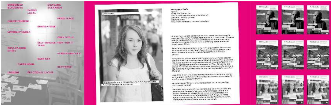
Figure 1. A sampling from Energy Futures methods documentation

Our objectives in the project ‘Switch! Energy Futures’ included generating scenarios/visions of future energy consumption and developing relevant design methods in relation to those within futures studies. Based on energy forecasts and social trends drawn from futures studies, Energy Futures revisits familiar urban and domestic artifacts in light of potentially emerging behaviors, beliefs and politics. Countering both the incremental reforms of user-centered design and the polarities of utopia/dystopia in critical design and visionary architecture (cf. Spiller, 2006), we set out to investigate the design of transitions between the familiar now and extreme futures. Resulting scenarios/visions from the project take the form of a series of redesigned artifacts that (fore)tell stories of transformed lifestyles and urban life. These were then mobilized in a public setting to host a debate with stakeholders about probable and preferred futures of electricity consumption. The project was developed by Aude Messenger, Thomas Thwaites, Başar Önal and myself, and an extended account is published elsewhere (Mazé, Messenger, Thwaites, & Önal, 2013).