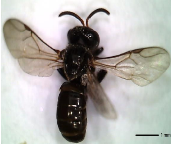
Figure 1. T. laeviceps bee Morphology

propolis and bee pollen which are beneficial for health and have high nutritional value. The morphology of the T. C worker bee is generally characterized by a glossy black dominant body color, as shown in Figure 1. The head and thorax are black, while the abdomen is blackish brown.