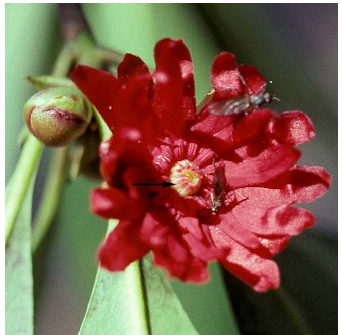
Fig. 3. Flower of Illicium floridanum ( \times 2 ). Upright carpels are no longer receptive to pollen. Anthers are just beginning to dehiscence (see head of arrow) indicating start of male phase.

pool” during the protogynous “female phase” is recorded in species of Nymphaea and Ondinea (Table 3). This fluid is not a nectar because insects do not drink it. Rather, it appears to “wash” pollen off insects that wade through and are trapped in the pool. In contrast, dry stigmas have been reported in four genera ( Amborella , Trimenia , Kadsura , and Illicium ) in the ANITA grade and in such magnoliid families as the Chloran-