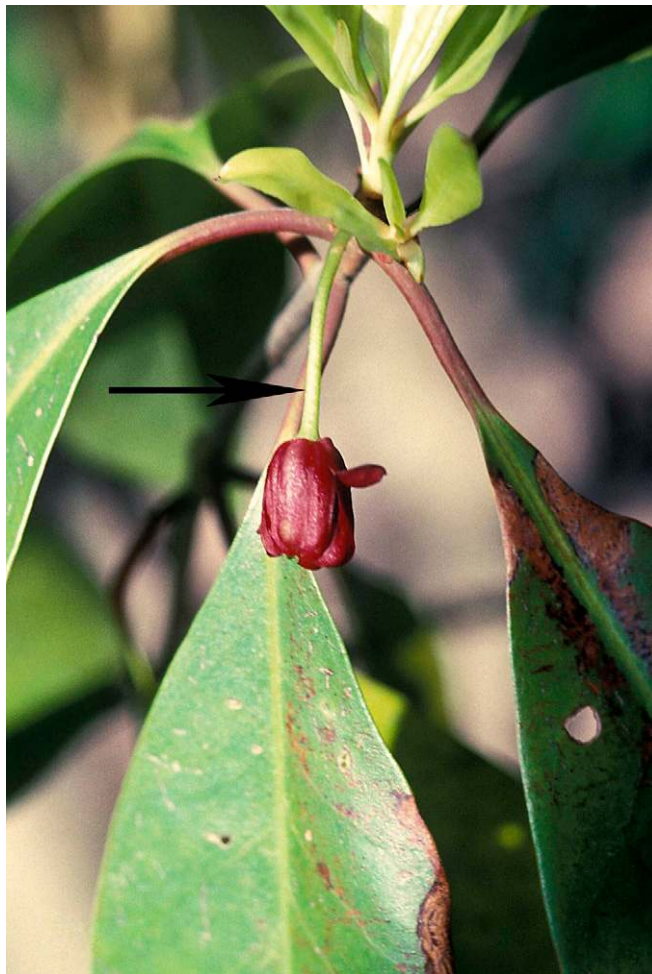
Fig. 4. Opening bud of Illicium floridanum ( \times 1 ), showing pedicel (arrow).

The various floral parts differ greatly in heat production throughout the rhythm (Fig. 2). In the diurnal set, the pedicel produced the greatest amount of heat of all the floral parts in excess of the ambient temperature (Figs. 2, 4). In the diurnal set, excess temperature of the pedicels was significantly different from that of the apical residua, stigmas, and carpels during the second ( F = 12.25 , root mse = 0.95, df = 47 , P < 0.0001 ), third ( F = 21.93 , root mse = 0.94, df = 47 , P < 0.0001 ), and fourth ( F = 8.21 , root mse = 1.66, df = 47 , P = 0.0002 ) measurement periods. The pedicel is thin (1.7–2.0 mm diameter; Fig. 4) and at the time of heat measurement its length varied from 1.2 to 3.8 cm in length. The pedicel grows throughout the functional life of the flower and, if fertilized the young fruits may produce a pedicel >7 cm in length (Fig. 3). Thus, the pedicel is a “hot rod.” In the diurnal set the apical residuum produced the lowest quantity of heat (Fig. 2).