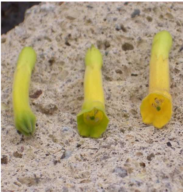
FIGURE 1: Stages of flower development in Nicotiana glauca . From left to right: closed late stage bud; newly opened flower; older flower showing colour change of mouth of corolla tube from green to yellow. Photograph by Jeff Ollerton in an invasive population on Tenerife.

populations of northwest Argentina, a flower colour polymorphism is present which includes dark red, reddish yellow and yellow morphs.