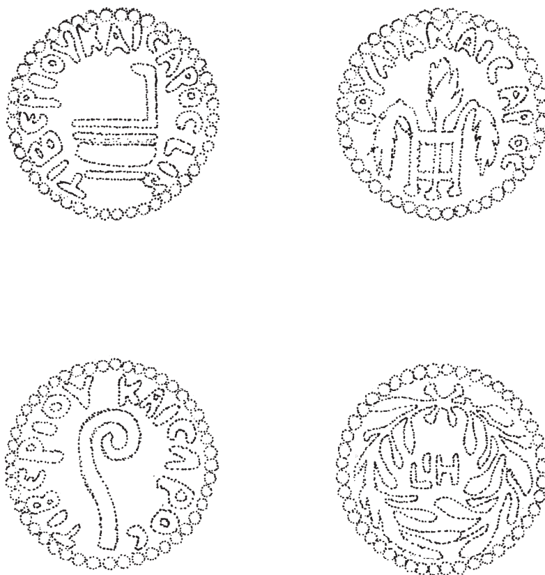
Figure 1: Bronze coins issued by Pontius Pilate: type 1 above and type 2 below. (J. E. Taylor)

There are two types: type 1 shows a simpulum on the obverse and three ears of wheat or barley on the reverse, while type 2 shows a lituus on the obverse with a laurel wreath on the reverse. On the obverse of both coins is the Greek legend 'ΤΙΒΕΡΙΟΥ ΚΑΙΣΑΡΟΣ', 'of Tiberius Caesar'. On the reverse of the type 1 coins there is the legend 'ΙΟΥΛΙΑ ΚΑΙΣΑΡΟΣ', 'Julia, of Caesar', and with type 2 there is no legend on the reverse (see Fig. 1). 9