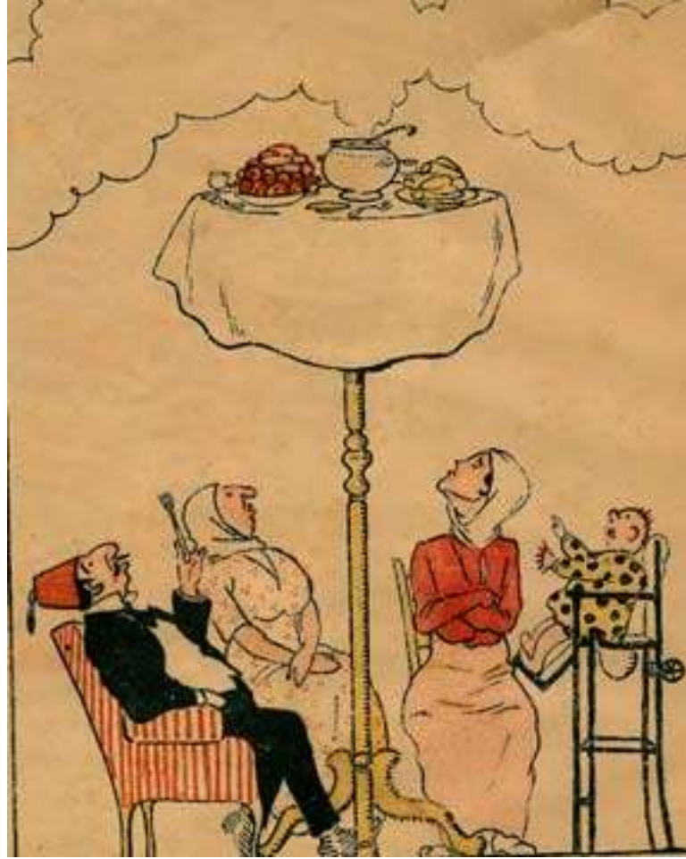
Fig. 1 A caricature which criticizes the high prices which made most of the food items beyond the reach of ordinary people.

Source: Diken , No. 1 (30 Teşrin-i Evvel 1918 [30 October 1918]), p. 5.