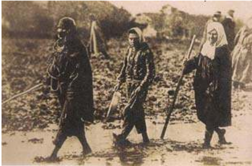
Fig. 9 Miserable refugee women on the way to Ottoman lands right after the Balkan Wars.