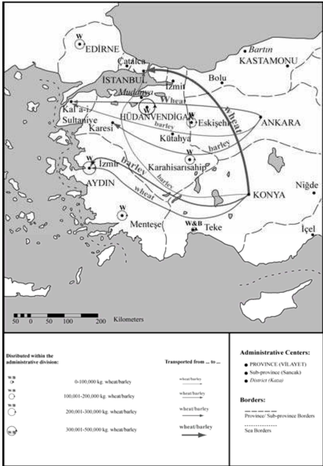
Map 2. Regions That Were Sent Wheat and Barley According to the Bylaw of 4 September 1916

Note: The data is taken for this map from 1332-1333 Meclis-i Mebusan Encümen Mazbataları ve Levâh-i Kanuniyye , Devre: 3, İçtima Senesi: 3 (Ankara: TBMM Basımevi, 1992), p. 297.