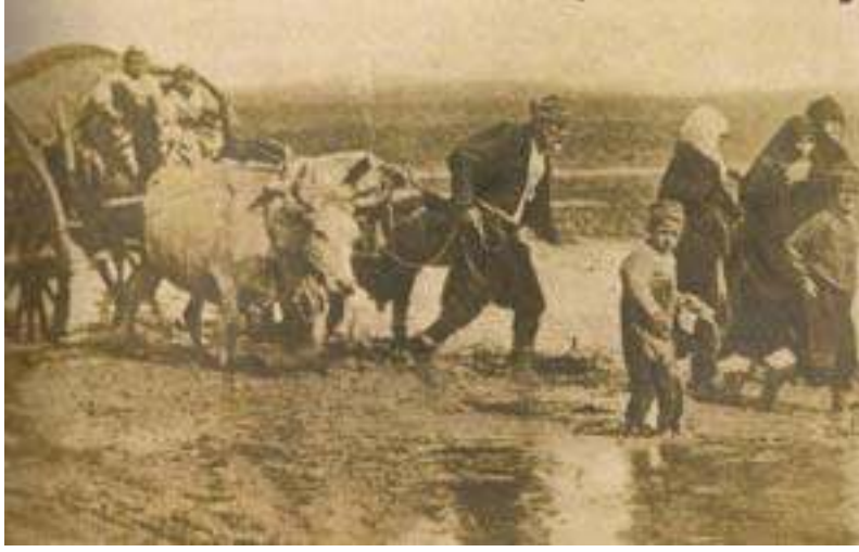
Fig. 10 A group of refugees, probably a family, on the way to Ottoman lands right after the Balkan Wars.