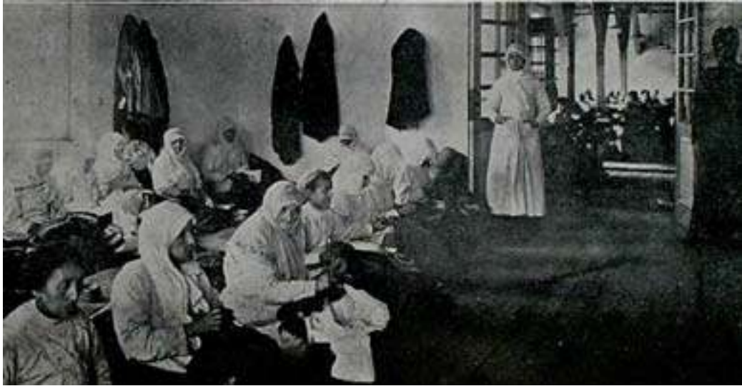
Fig. 17 Women who are preparing clothing for the army.

to sew these at a very low price. 1097 Thousands of women also worked in the army's sewing workshops where they both learned the profession and produced soldiers' clothing. 1098 A sewing school was opened by Behire Hakkı in 1913 with 27 students, a number which increased to 366 in 1917. These students opened their own shops, worked at home or became sewing teachers, increasing the number of women tailors further. 1099 The school was also supported by the government because it saved many poor women from destitution by giving them a means to support themselves. 1100