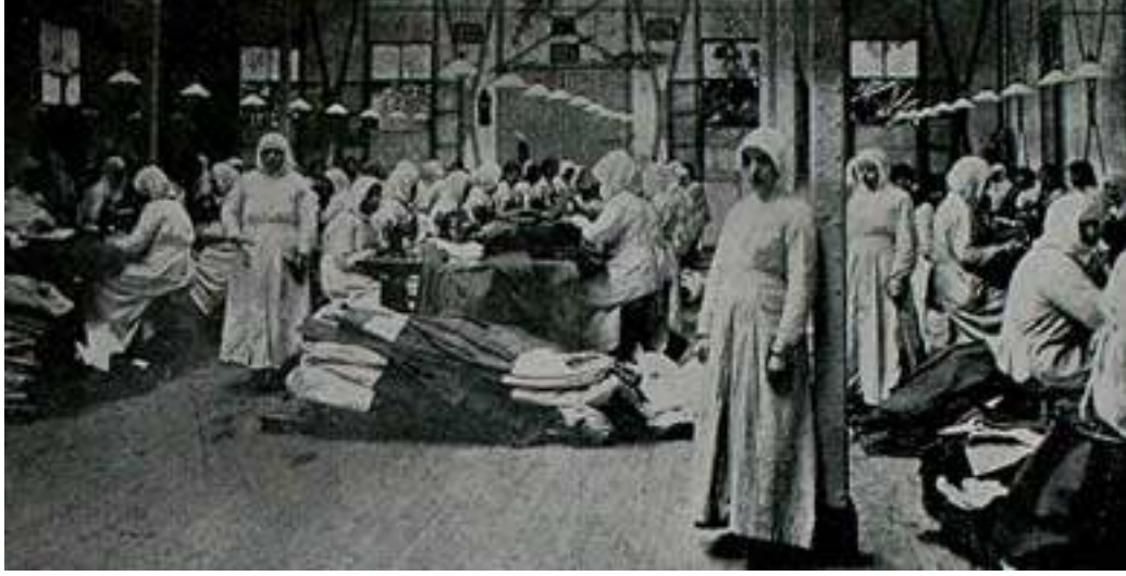
Fig. 16 A group of women who are employed in the Army Sewing Depot.

hospitals as nurses. 1094 Just like them, many nurses received professional education after they began to work as nurses. 1095 The importance of trained midwives also increased because local governments demanded their work. 1096