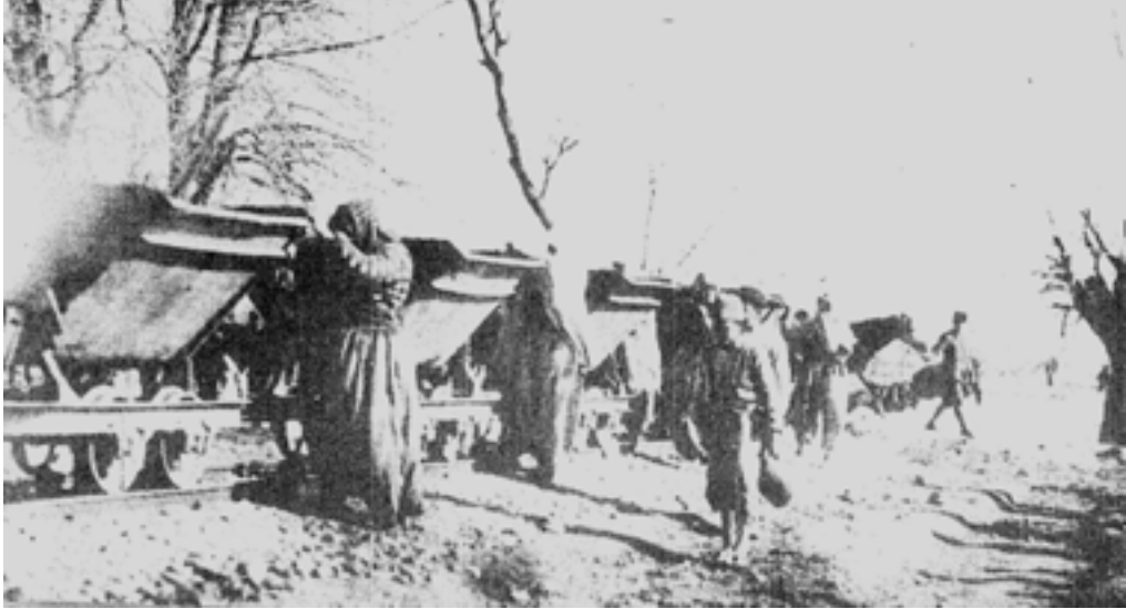
Fig. 27 Women working on the Azarköy railway during the National Struggle.

obligatory for the people to carry ammunition for the army up to 100 kilometers per month. 1496