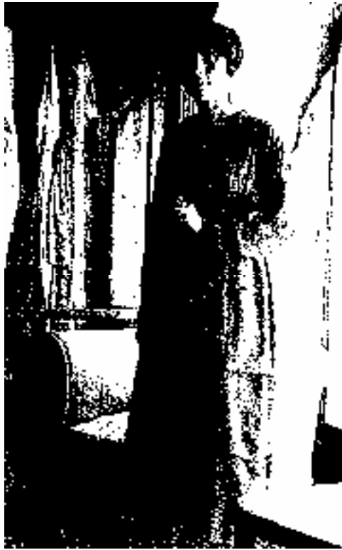
Fig. 22 A Turkish sales-woman who work in a clothing shop in İstanbul during the Armistice period.