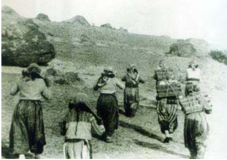
Fig. 29 Anatolian women carrying ammunition during the National Struggle.

their real experience of this war obligation is still one of the least known parts of Turkish history.