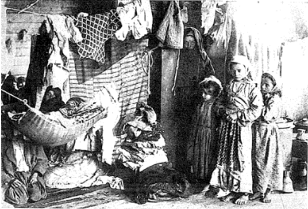
Fig. 6 Women and children who live in a mosque in İstanbul.

bombed by the enemy from the air, writing that they looked more horrible and desolate than a cemetery. 806