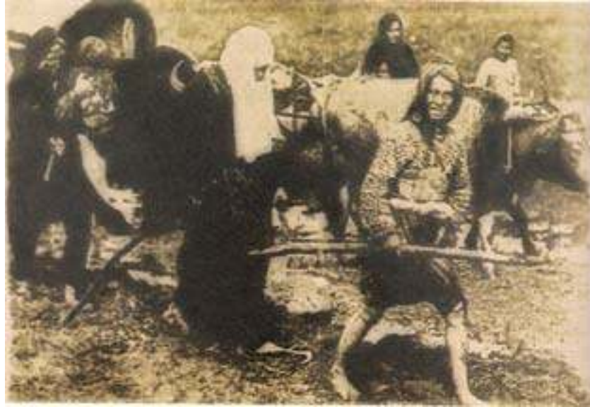
Fig. 8 Muslim refugee women on the road right after the Balkan Wars.

1921. 822 All these population movements created a problem of housing for families, especially those who were deprived of their male relatives who were under arms or lost or died during the long war years. This problem especially hit the needy women and their children without support of their families.