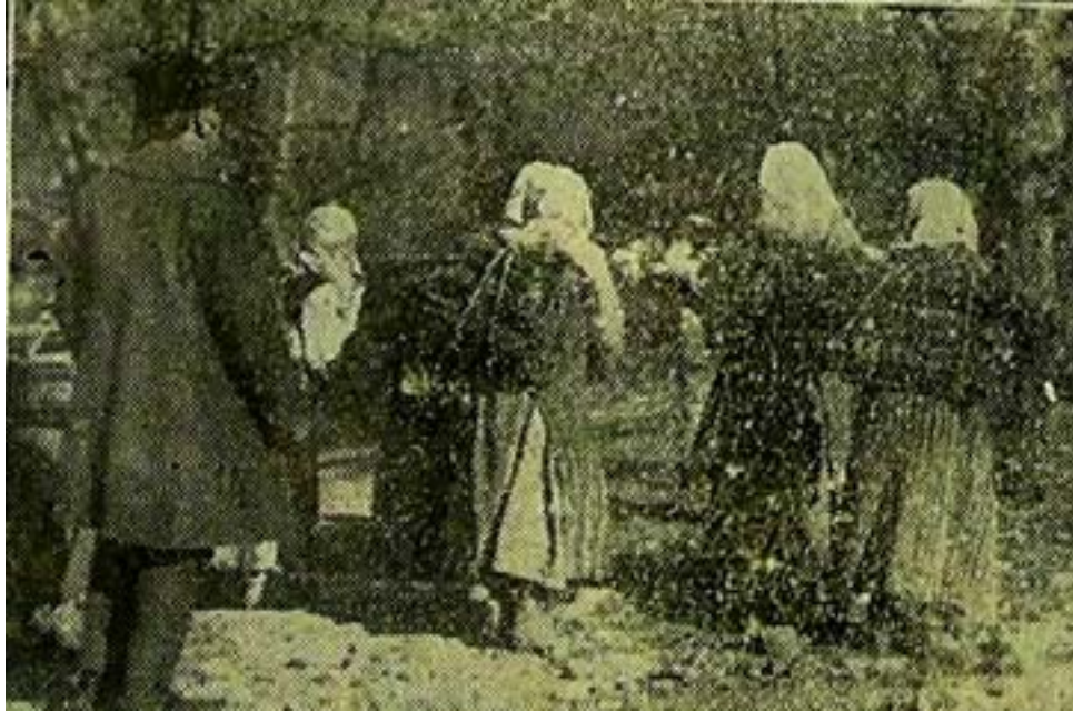
Fig. 28 Anatolian women carrying ammunition on their backs during the National Struggle.

The obligation to carry ammunitions according to the fifth order of the national taxes ( Tekalif-i Milliye ) up to 100 kilometers per month was also not welcomed in certain districts. For instance, fearing that the population could accept this obligation as a cruelty, the notables of Kayseri raised a fund and used it to send the necessary goods in five days. 1499