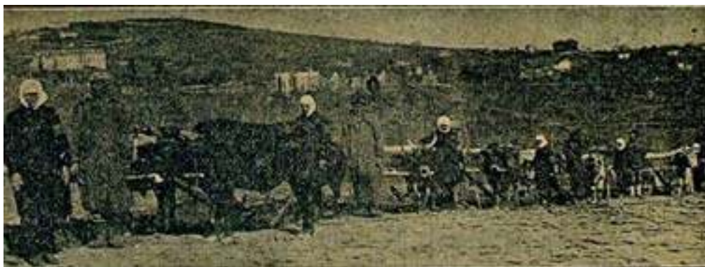
Fig. 18 The First Women Workers' Battalion while doing agricultural work.