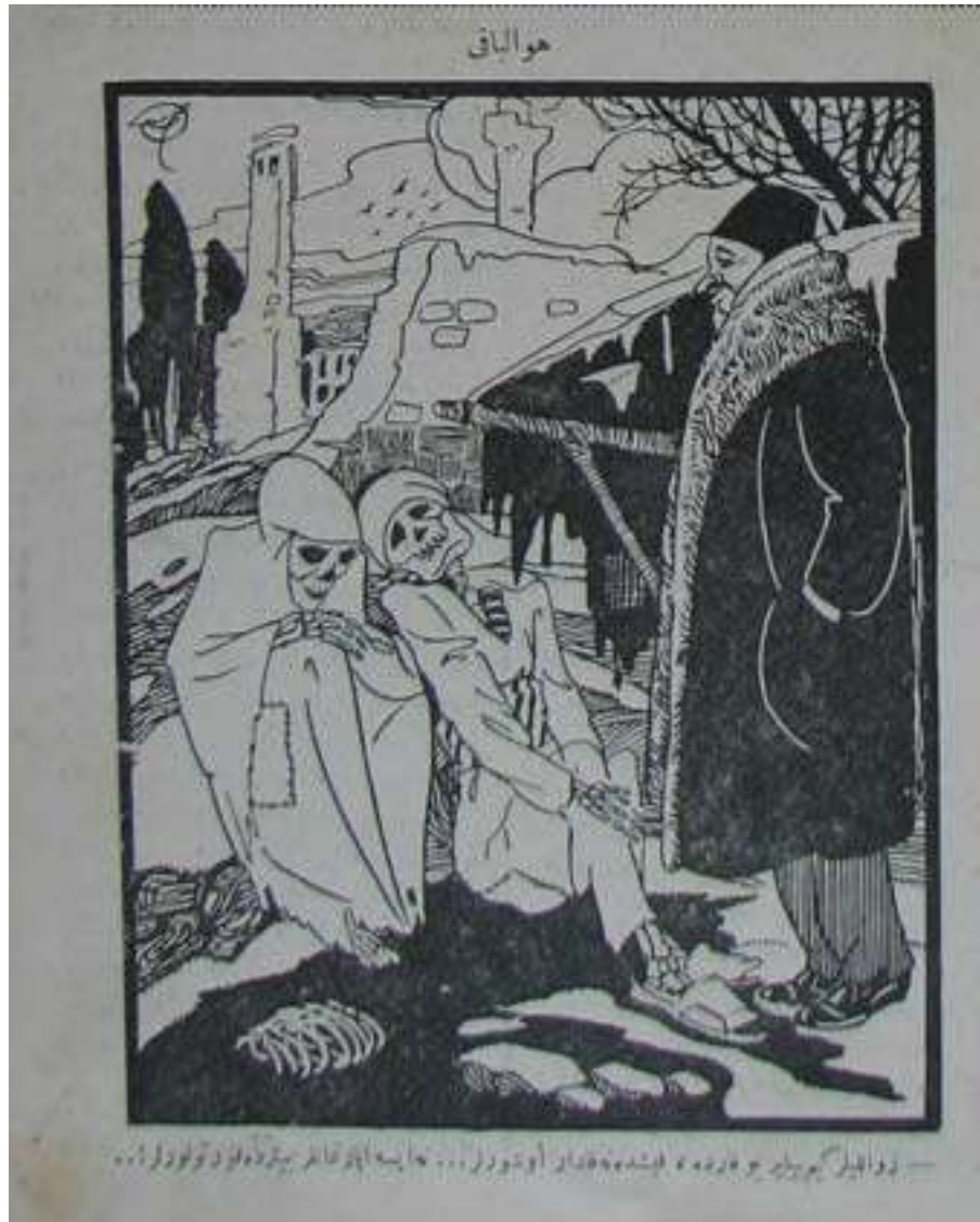
Fig. 11 This caricature criticizes the housing problem. A rich man is looking at poor people who have died on the street out of cold and says that they could be saved from this weather when he finishes building his apartments, a residence that only the rich could live in during the war years.

maximize their profits, avoided providing most refugees with what they were entitled. 898 Many of the refugees of the Balkan Wars could only be settled in the mosques in the capital city for a long time. 899