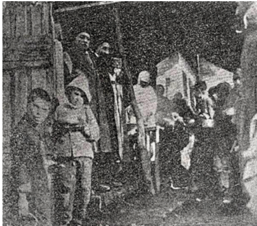
Fig. 3 A woman cook in a white uniform distributes food to the poor in a Red Crescent soup kitchen in İstanbul.

The Red Crescent Society also founded many public soup kitchens in İstanbul. According to Ahmed Emin, the number of these free kitchens reached 22. 563 During the war, they reached the capacity to feed about 35,000 people each day. The districts in which these soup kitchens were located were those in which the poor population of the city lived such as Topkapı, Üsküdar, Eyüpsultan, Kasımpaşa, Kumkapı, Fatih, Cibali, Alipaşa, and Kartal.