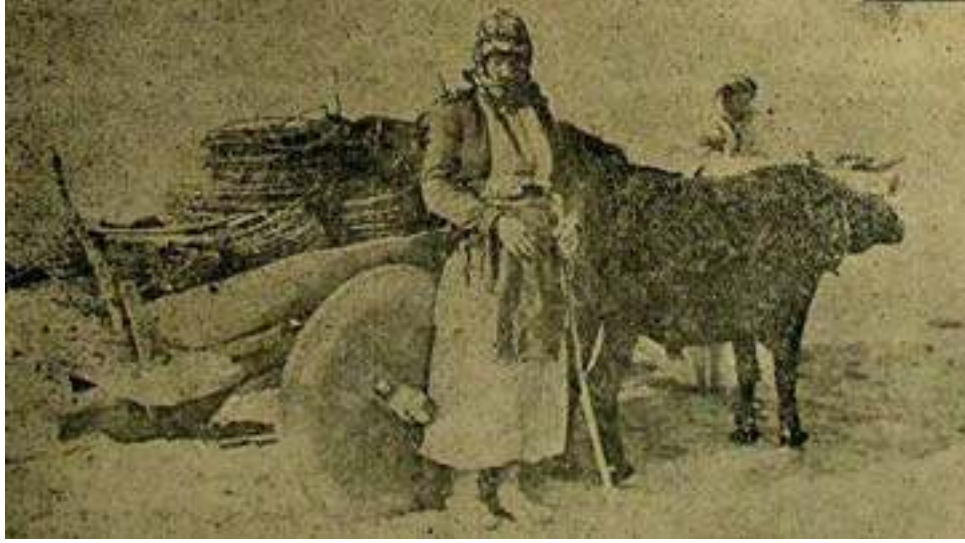
Fig. 25 Two women carrying ammunition in an oxcart for the Ottoman army on Caucasus roads in World War I.

been brought there by force, had fallen down in a fit. She explained with difficulty that she had been forced to leave her baby behind at home, because the gendarmerie had forced her to come at gunpoint. They had not listened to her when she had tried to tell them that her baby was all alone. She feared that the baby would die and stink because it took a total of eight days to go to Bursa and coming back to her village. 1490