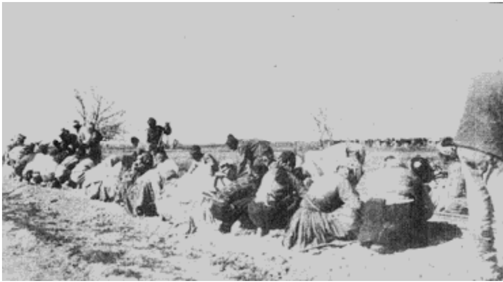
Fig. 26 Women repairing the Çobanlar-Afyon railroad during the National Struggle.

were financed largely with taxes. 1493 Therefore, during the National Struggle, the percentage of the taxes increased sharply in the national budget from 43.8 million Ottoman liras in 1920 to 71.7 million in 1923. 1494 Consequently, the poor people most of whom were peasant women, shouldered the great part of the economic burden of the National Struggle. 1495