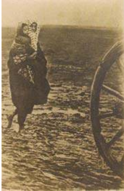
Fig. 7 A refugee mother on the road with her baby right after the Balkan Wars, which on the eve of World War I.

The situation of refugee women was worst in the East. By December 1918, in the eastern provinces, many Muslim refugees with no house to live in suffered from the cold and from the frequent attacks of wolves in winter. 818