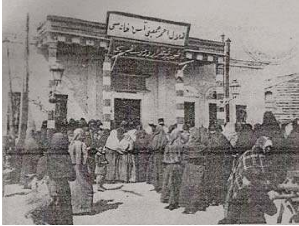
Fig. 4 Poor women waiting in front of a Red Crescent soup kitchen that was set up in the building of the Topkapı Society for Assistance to the Poor ( Topkapı Fukaraperver Müessesesi-i Hayriyesi ) in İstanbul.

Source: Nil Sarı and Zuhâl Özeydın, I. Dünya Savaşında Hilâl-i Ahmer Cemiyeti'nin Sağlık ve Sosyal Yardıma Katkıları (Ankara: Türk Tarih Kurumu Basımevi, 1999), p. 56.