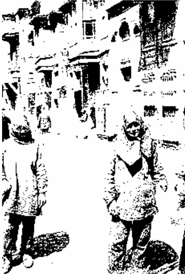
Fig. 14 Two Turkish women who work as street sweepers in İstanbul during the Armistice period.