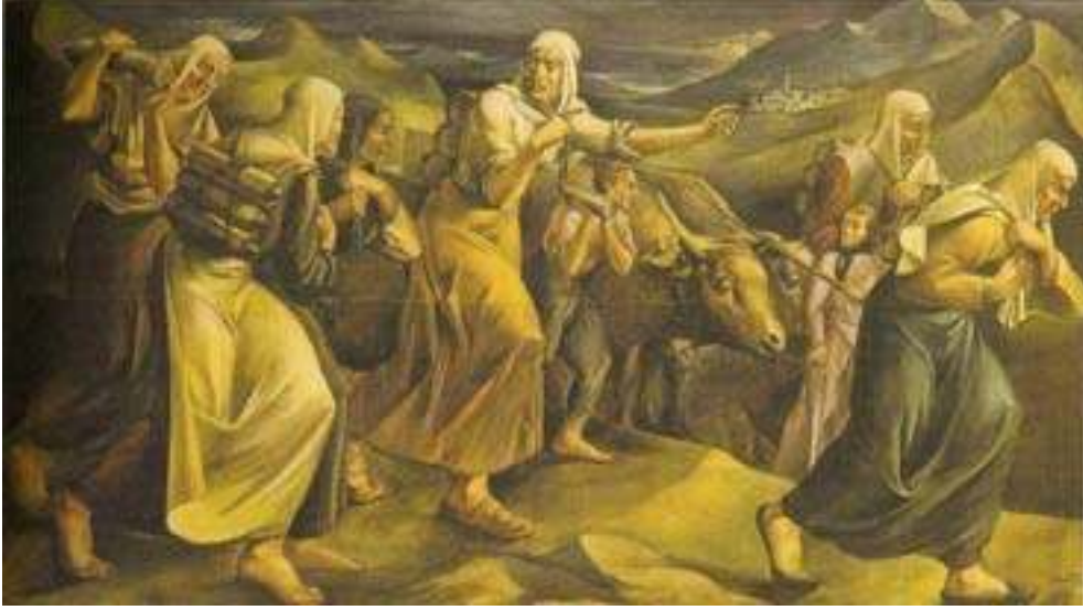
Fig. 24 The famous painting of a Turkish painter, Halil Dikmen, which depicts Anatolian women transporting ammunition during the Turkish Independence War.

lives, divorce or marriage, which had important economic consequences for them in the war years.