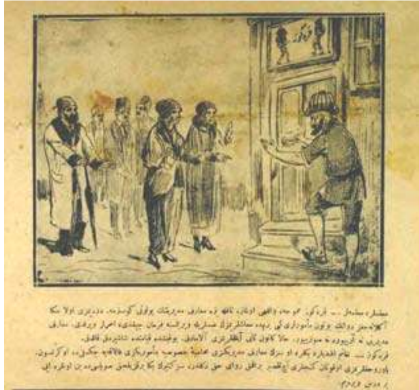
Fig. 23 This caricature criticizes the unpaid salaries of teachers, some of whom were women. Women teachers complain to Karagöz about their financial problems and not finding the Director of Education to claim their rights. Karagöz answers that he and his officers deserved a whacking for this situation.

legitimate by the Education Council in the Ottoman parliament. 1402 Nevertheless, on 24 December 1916, the Fiscal Equilibrium Council rejected it. 1403