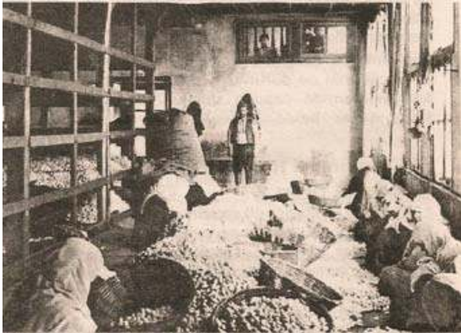
Fig. 13 Muslim women who work in silk production in Bursa.

carpet making in İzmir, Sivas, Ankara and Konya (including Akşehir, Isparta and Niğde) reached about 4780. It was reported that 11,000 women were employed in textile manufacturing in Aydın. The number of those female workers who were employed in Kütahya, Eskişehir, and Karahisar was about 1550. Women also worked on 1000 looms in Diyarbakır that men had left due to war. 1041 In many of these factories, the salaries of women were about one-third to one-sixth of what was paid to men. 1042