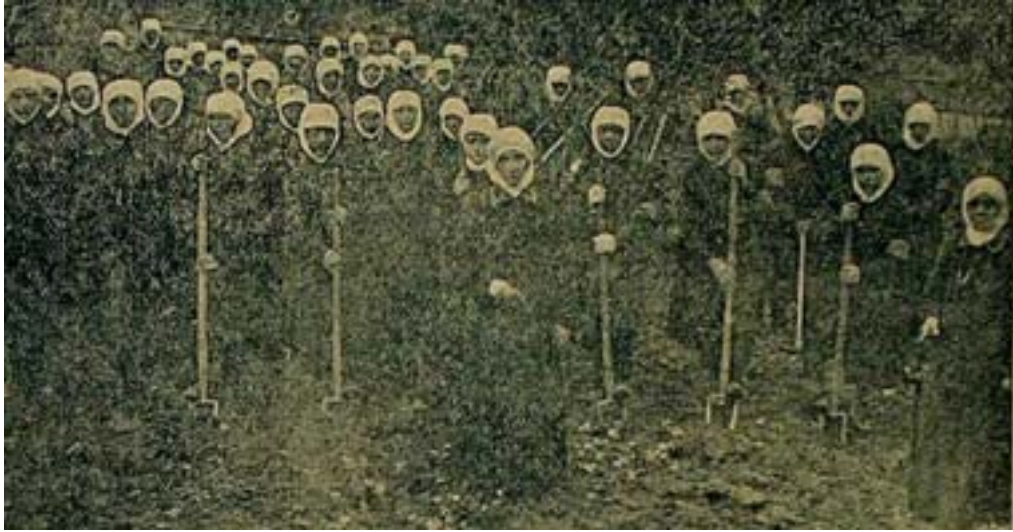
Fig. 20 Women workers in the First Women Workers' Battalion with their army clothing in which they were ordered to do agricultural work. Although their clothing was unfit for this work, especially during the summer, the army authorities forced them to wear to do so.

Correspondences between the Ministry of War, the army and the Society for the Employment of Ottoman Muslim Women in August-September 1917 reveal that Muslim women worker's use of baggy-trousers and a jacket without putting on a yeldirme was not approved by the War Minister, Enver Pasha. Therefore, those women workers who had to toil for long hours in the open air had to wear additional garments unsuitable for their tasks. 1291