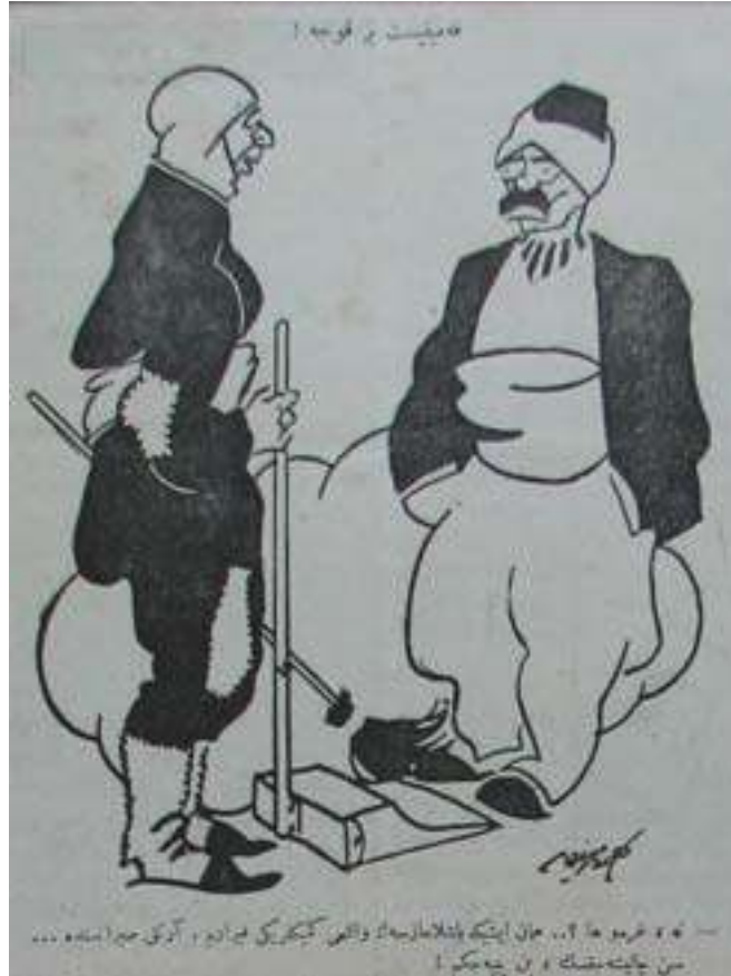
Fig. 21 This caricature mocks the strike of women street cleaners in İstanbul in February-March 1922. An allegedly “feminist” husband orders his street sweeper wife to go back to work by telling her that from then on she would work outside and he would spend the money she earned.

by foreigners. 1310 Therefore, the Ottoman workers' movement was not effective in the Armistice period. 1311