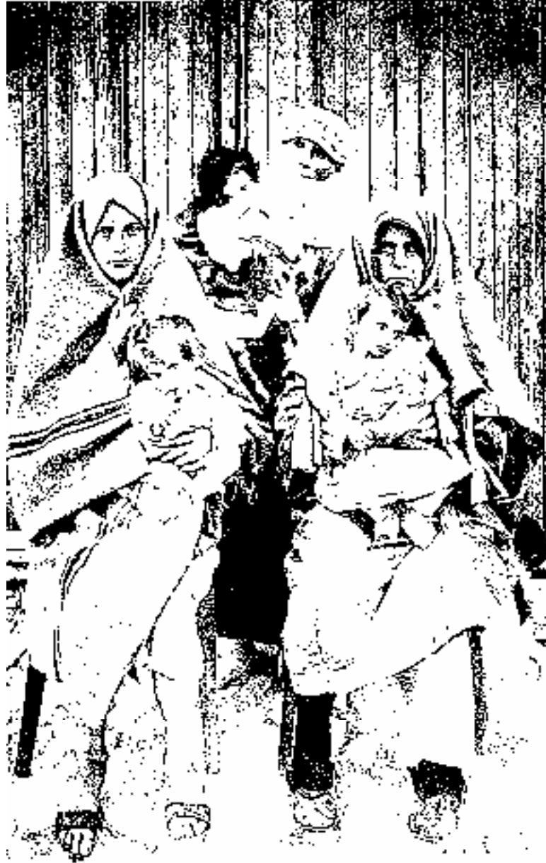
Fig. 12 Refugee mothers whose children are about to die due to hunger.

washwoman in the homes of others, as plasterer in construction, as quilt maker and as dishwasher in the Red Crescent soup kitchens. 989