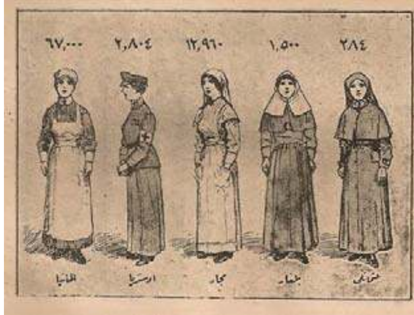
Fig. 19 This illustration compares the number of women working as nurses in different countries that were allies of the Ottoman Empire during World War I. According to this illustration, the number of Ottoman women nurses was limited to only 284 in 1917 while the same number was 1500 in Bulgaria, 12,960 in Hungary, 2,804 in Austria, and 67,000 in Germany.

who graduated from Dârü'l-fünûn and who had studied in Europe or America had to work as general practitioners and they could not become specialists because of the prejudices of the male colleagues. Until 1930 female doctors could not receive official appointments from the Ministry of Health. 1195