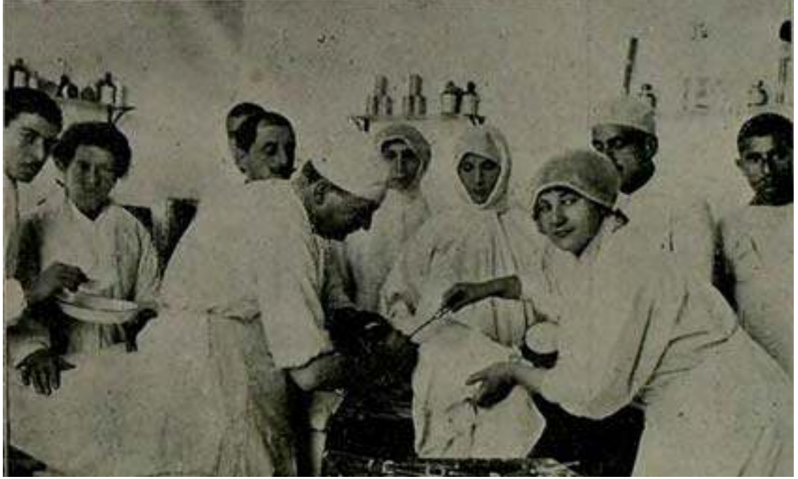
Fig. 15 Turkish nurses who assist a surgeon in a surgery during World War I.

postcards, rosettes, medallions and plaques of the Society. Nurses were depicted often helping the wounded soldiers or serving them water in such iconography. 1092