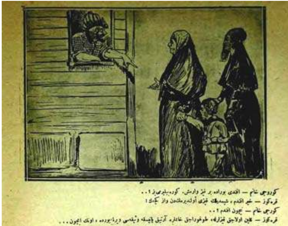
Fig. 2 A caricature that criticizes the shortage of clothing. Karagöz as the host of the house refuses to accept women who want to see a young woman inside the house for organizing an arranged marriage. He tells them that it has been decided not to marry her off since the government no longer gives ration cards for fabric to future brides and pregnant women.