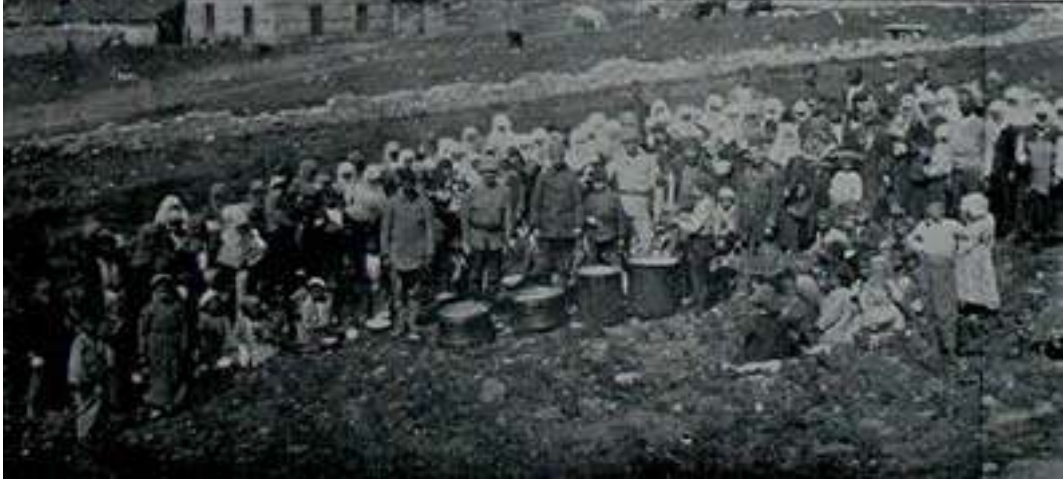
Fig. 5 A group of women and children who were members of soldiers' families and among those 4,000 people who daily received food from the Ottoman army in Kavala and Drama, two districts of Salonica which were not Ottoman territories during World War I.

died out of hunger. According to Abdullah, many other women and children could only eat grass and herbs and were about to die so they had to be assisted immediately. 591