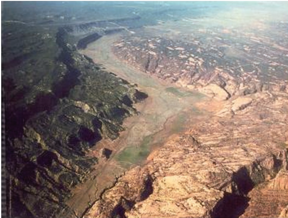
Fig. 1. Long House Valley, looking to the South.

the rise and fall of alluvial groundwater and the deposition and erosion of flood plain sediments. Based on statistical relationships between PDSI and annual crop yields in southwestern Colorado provided by Van West (14), these measures of environmental variability are used to create a dynamic landscape of annual potential maize production, in kilograms, for each hectare in the study area for the period A.D. 400-1400. Intensive archaeological research provides a database on human settlement in the valley (8, 15). l Finally, detailed regional ethnographies provide an empirical basis for generating plausible behavioral rules for the agents (17–19).