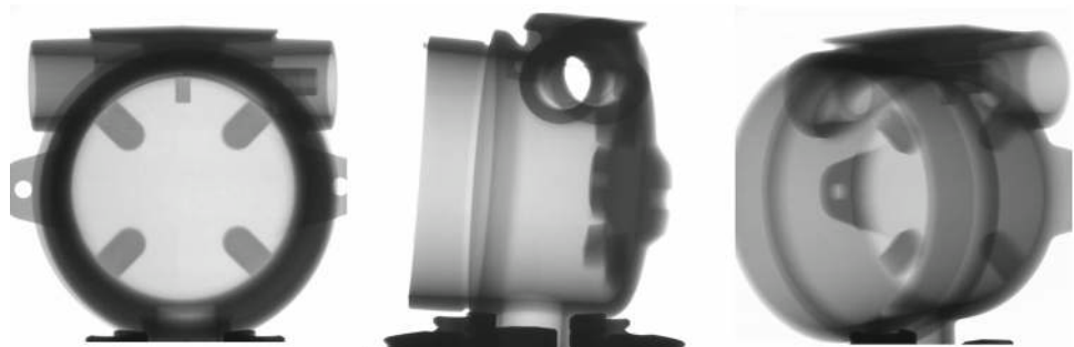
Fig. 2 Different types of X-ray imaging projections of the instrument housing produced with casting technology