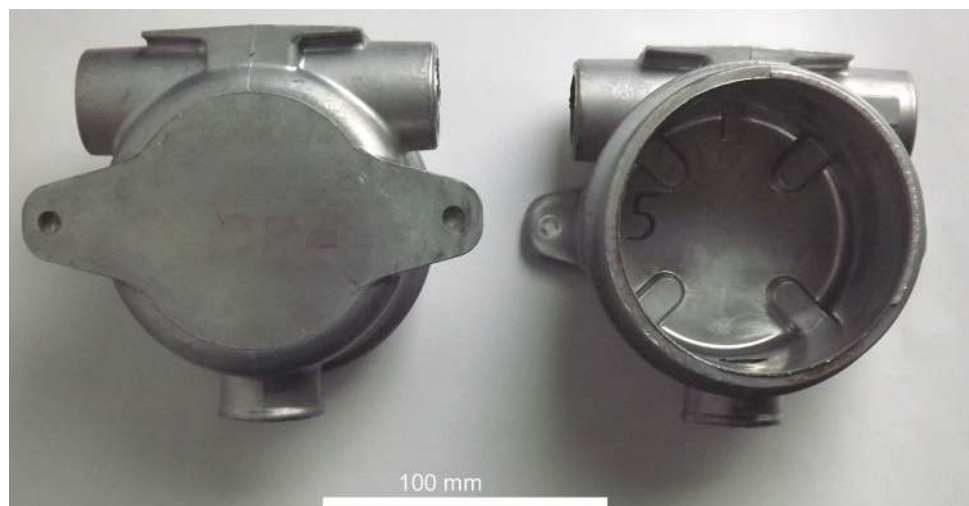
Fig. 1 Instrument housing produced with casting technology

The industrial Yxlon MU2000 X-ray was used in the radiographic research for internal analysis of casting defects. The test apparatus was equipped with an X-ray tube with