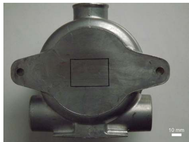
Fig. 4 Instrument housing produced by using casting technology. The black rectangle shows the selected area from which the samples were collected for ultrasonic measurements

However, the ultrasonic examination allowed us to use the dependence of the variable speed of ultrasonic wave propagation in different media (an ultrasonic wave propagates more than 10 times faster in metal than in air). On this basis it can be concluded that the increased volume fraction of porosity will cause a reduction in the speed of ultrasonic wave propagation. In order to verify this assumption, cuboidal samples with dimensions of approximately 25 × 35 × 5 mm (width × height × thickness) were cut out from the castings (Fig. 4).