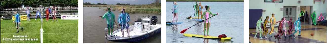
Figure 5: Selected frames from sample sequences with MOTA score above 75% with predictions of our ArtTrack-baseline overlaid in each frame. See text for further description.