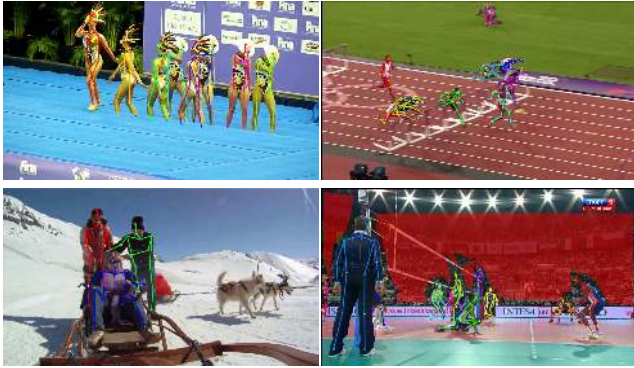
Figure 2: Example frames and annotations from our dataset.

on multi-person articulated tracking, progress in the single-frame setting will inevitably improve overall tracking quality. We thus make the single frame multi-person setting part of our evaluation procedure. In order to enable timely and scalable evaluation on the held-out test set, we provide a centralized evaluation server. We strongly believe that the proposed benchmark will prove highly useful to drive the research forward by focusing on remaining limitations of the state of the art.