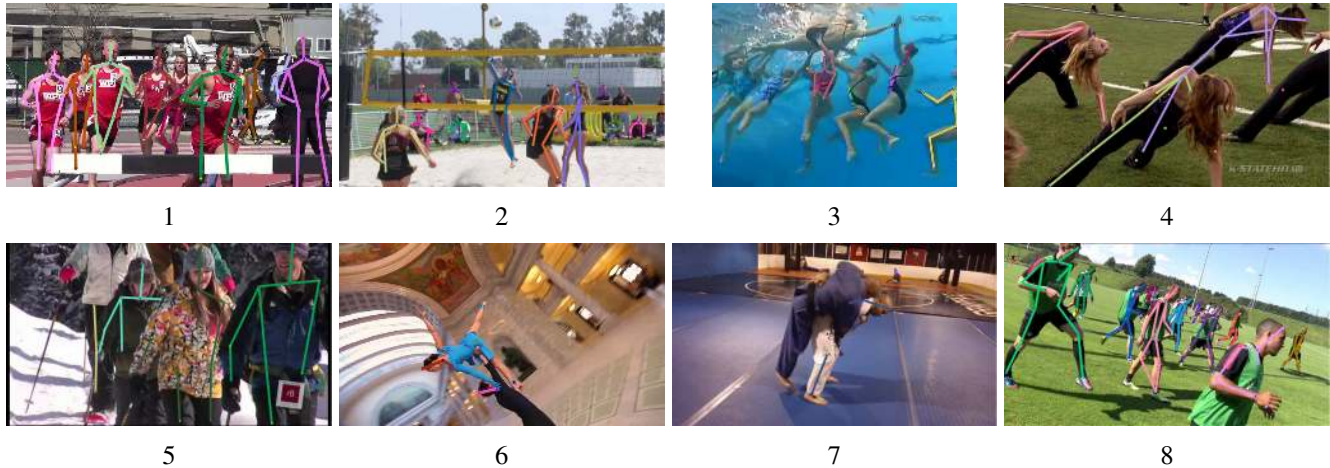
Figure 6: Selected frames from sample sequences with negative average MOTA score. The predictions of our ArtTrack-baseline are overlaid in each frame. Challenges for current methods in such sequences include crowds (images 3 and 8), extreme proximity of people to each other (7), rare poses (4 and 6) and strong camera motions (3, 5, 6, and 8).

accuracy are affected by pose complexity. As a measure for the pose complexity of a sequence we employ an average deviation of each pose in a sequence from the mean pose. The computed complexity score is used to sort video sequences from low to high pose complexity and average mAP is reported for each sequence. The result of this evaluation is shown in Fig. 4 (middle). For visualization purposes, we partition the sorted video sequences into bins of size 10 based on pose complexity score and report average mAP for each bin. We observe that both body pose estimation and tracking performance significantly decrease with the increased pose complexity. Fig. 4 (right) shows a plot that highlights correlation between mAP and MOTA of the same sequence. We use the mean performance of all methods in this visualization. Note that in most cases more accurate pose estimation reflected by higher mAP indeed corresponds to higher MOTA. However, it is instructive to look at sequences where poses are estimated accurately (mAP is high), yet tracking results are particularly poor (MOTA near zero). One of such sequences is shown in Fig. 6 (8). This sequence features a large number of people and fast camera movement that is likely confusing simple frame-to-frame association tracking of the evaluated approaches. Please see supplemental material for additional examples and analyses of challenging sequences.