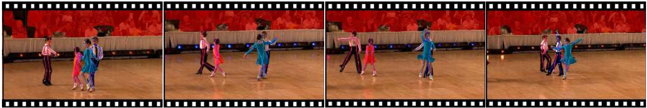
Figure 1: Sample video from our benchmark. We select sequences that represent crowded scenes with multiple articulated people engaging in various dynamic activities and provide dense annotations of person tracks, body joints and ignore regions.