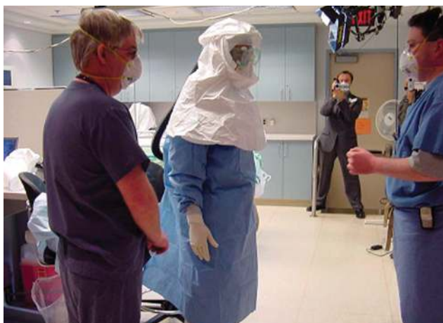
Figure 2. Healthcare worker wearing powered air-purifying respirators for demonstration.

protection against airborne diseases, even if not absolutely required for SARS, will ensure that staff are prepared to deal with future emerging infectious diseases or bioterrorism events that could involve airborne agents.