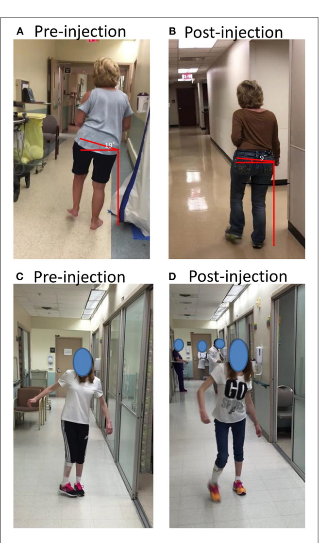
FIGURE 2 | (A,B) A stroke survivor with spasticity that resulted in dramatic trunk lateral flexion and hip hiking before and after botulinum toxin injections; (C,D) A stroke survivor with spasticity that resulted in dynamic hip adduction and pelvic anterior rotation before and after botulinum toxin injection. See text for details.

A 62 year old right-handed female suffered right middle cerebral artery ischemic stroke 6 years ago with a residual left spastic hemiplegia. She was able to ambulate without any assistive device at a moderate walking speed. She presented with a mild