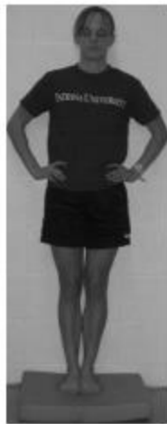
Double leg stance on a foam surface (Dfo)