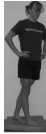
Tandem stance on a foam surface (Tfo)