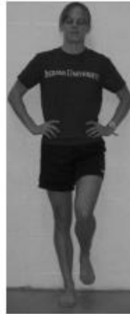
Single leg stance on a firm surface (Sfi)