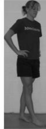
Tandem stance on a firm surface (Tfi)