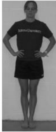
Double leg stance on a firm surface (Dfi)