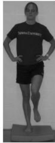
Single leg stance on a foam surface (Sfo)