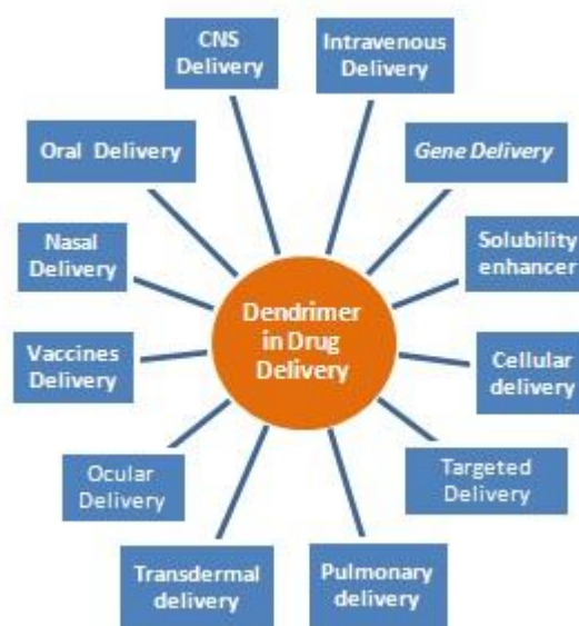
Figure 3: Various application of dendrimers in drug delivery

size and shape of drug or imaging-agent cargo-space; (ii) biocompatibility, non-toxic polymer/pendant functionality; (iii) precise, nanoscale-container and/or scaffolding properties with high drug-loading capacity; (iv) well-defined scaffolding and/or surface modifiable functionality for cell specific targeting moieties; (v) lack of immunogenicity; (vi) appropriate cellular adhesion and internalization, (vii) adequate bio-elimination or biodegradation; (viii) controlled or stimuli-responsive drug release features; (ix) molecular level isolation and protection of the drug against inactivation during transit to target cells; (x) minimal non-specific cellular and blood–protein binding properties; (xi) ease of consistent, reproducible, clinical grade synthesis.