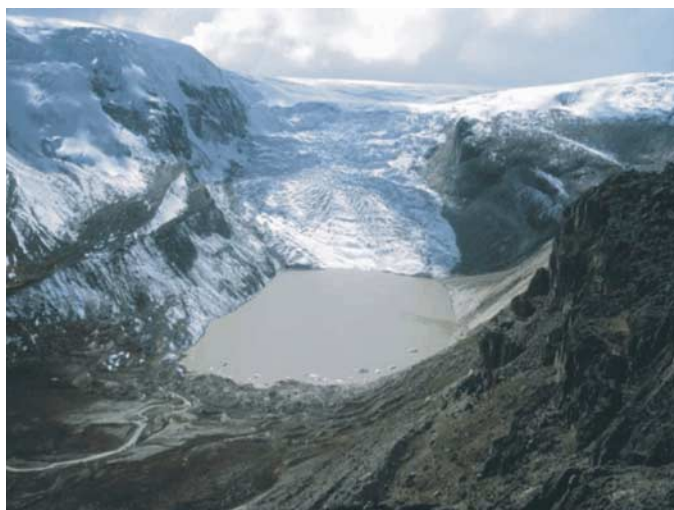
Figure 3 | Changes in the Qori Kalis Glacier, Quelccaya Ice Cap, Peru, between 1978 (a) and 2002 (b). Glacier retreat during this time was 1,100 m (L. Thompson, personal communication).