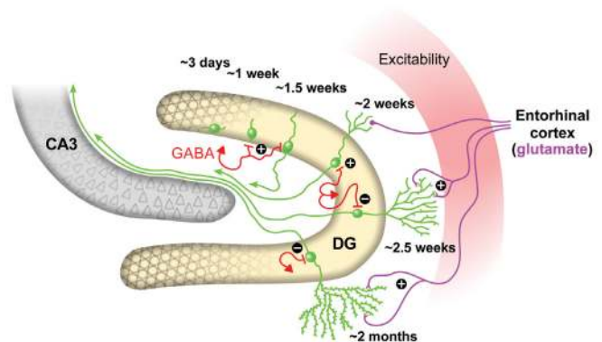
Figure 1 Growth and maturation of adult newborn granule cells. At 3 d, newborn cells have few projections and are migrating to their final location. At 1 week, early nonoriented dendrites appear, coupled with the onset of somatic GABA inputs (red neurons), and by 1.5 weeks, the primary apical dendrite extends to the molecular layer. Two-week-old neurons have aspiny, developed dendritic arborizations with extensive GABA input. By 2.5 weeks, spines have begun to appear, indicating the onset of entorhinal input, though not at the densities seen in fully mature cells. By 2 months, neurons have arborizations and electrophysiology similar to mature neurons. GABA is excitatory in immature neurons but becomes inhibitory around the time the excitatory glutamatergic synapses are established. The bar labeled excitability indicates the time period in which immature neurons have a distinct physiology, such as more depolarized resting potentials, and demonstrate increased LTP. Modified from ref. 30.

Published online 26 May 2006; doi:10.1038/nn1707