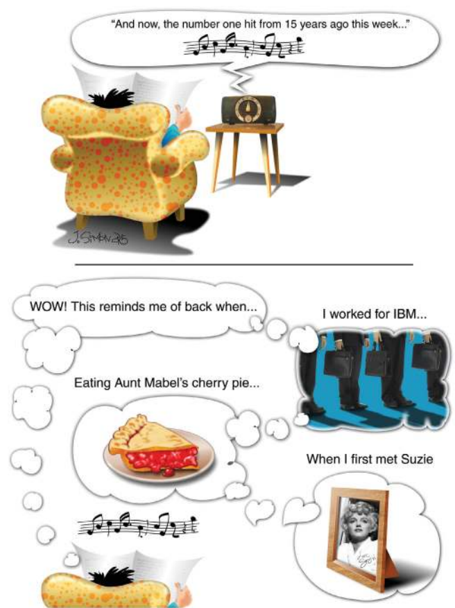
Figure 3 Cartoon example of how temporal associations may exist in long-term human memories. The reactivation of an old memory—such as hearing a hit song again years later—can induce the recollection of other memories that were formed at the same time. According to this hypothesis, these memories would have been originally encoded in part by the same set of young neurons, although this recall would most probably be hippocampus independent. Some memories may be general to the time of life—a summer internship, for example. Others may be repeated events that also occurred during that time period, such as visiting a relative. Finally, meaningful personal events may be recalled, such as meeting someone important for the first time.

For how long would this time association occur within the sparse codes produced by the dentate gyrus? The maturation of newborn neurons takes approximately 1 to 2 months in rodents 33 , but there are several phases of this maturation process 1 . The excitability of newborn neurons most probably decreases from the time spinogenesis begins (~16 days), which is around the same time GABA may begin to have an inhibitory influence on the neuron 31 . Whereas there are indications that newborn neurons remain more responsive than fully mature cells for some time 9 , the maturation of dendritic arborizations and reduced spine formation by 1 month of age 30 probably make the neurons respond more selectively. Because the subset of newborn neurons is constantly changing, the similarity in coding would be greatest for events occurring at about the same time, when each event would activate a similar newborn neuron population (Fig. 2b). As days and weeks pass, the young neurons would mature or die and others would