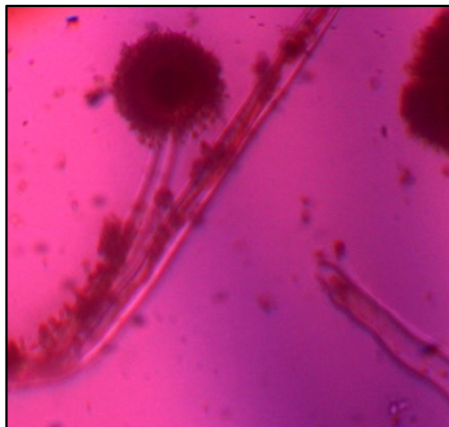
Figure 3. Microscopic image of Aspergillus niger (200x).

In such soil fungi may occur either as resting propagules or as active mycelia depending on the availability of nutrients and favourable environmental conditions [12]. Aspergillus niger [Figure 3] has been reported as an important strain helps in production protein rich organic fertilizer from fish scale [10].