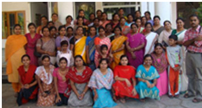
Kudumbashree women 2

The programme has also made some significant headway in relation to its aim of encouraging and supporting participatory citizenship, both in terms of its impact on individual women, and its broader challenge to everyday understandings of 'correct' female behaviour.