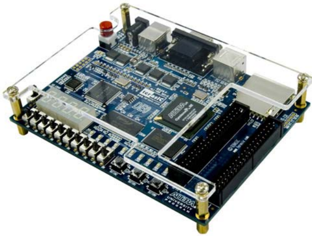
Figure 1. DE0 Board

Finally a recent work presents a dynamic power estimation methodology for the embedded multipliers in Xilinx Virtex-II Pro chips [13]; and [14] proposes a methodology for power measurements in FPGA devices.