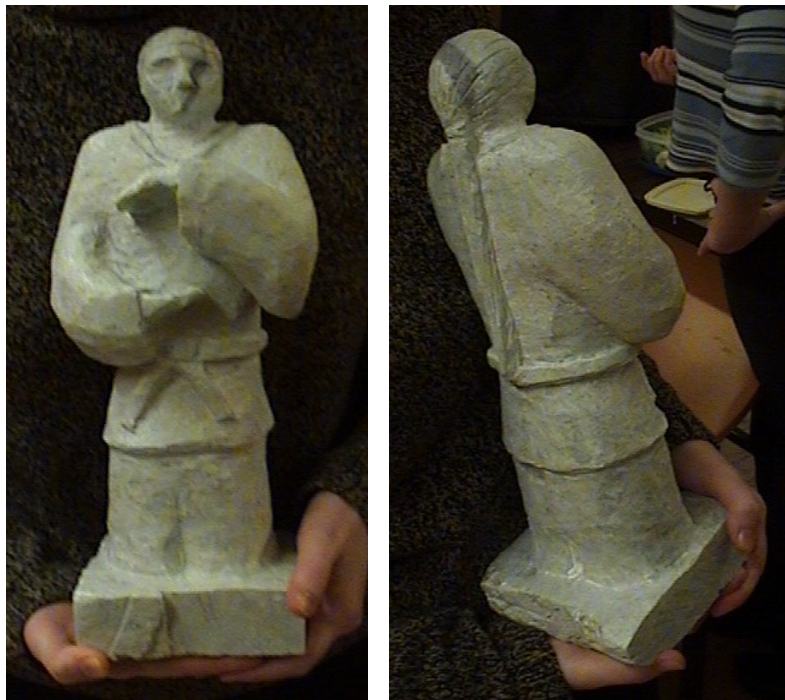
Figure 2. Nimky-Nene's soapstone carving

I was placed with what I call a dying spirit, a fading spirit. I'm a small town boy, I like the bush. Being in the city, I don't have the energy that you get from being in the bush. I needed to get physically active. I didn't have a lot of money. I needed to feel, in my own community—feel just the people and exercise. I didn't have money to join a big club. The only thing I can picture or imagine is how my spirit is in my belly, my energy in my belly. Before I could not feel it unless I was in ceremony, deep in ceremony and now everywhere I walk I can feel it, I can feel it and other people can see it. It's that attraction—kids come to me. I can physically chase them around now. (Nimky-Nene)