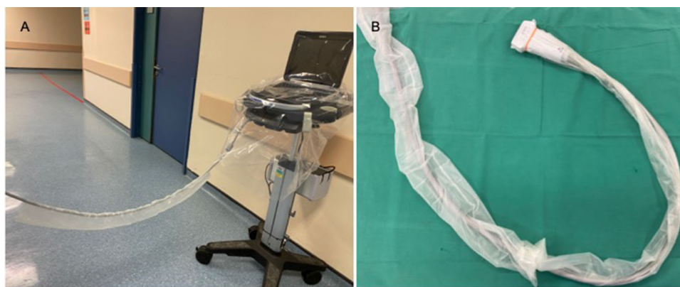
Fig. 2 The ultrasound probe is covered with a disposable sheath along its entire length so that any part of the probe that potentially may come in contact with the patient is protected. Depending on the type of sheath available, it may need to be extended with the use of more than one sheath. A) For example, the probe sheath in our

institution is too short to cover the entire length of the probe, so we cut off one end of a sheath to form a tube and slide it over the probe to cover the proximal half, and then B) use another (sterile) sheath to cover the distal half.