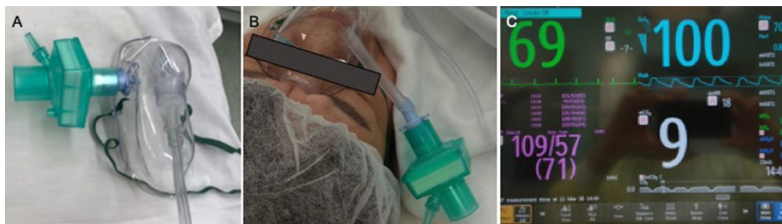
Fig. 3 Set up of capnography monitoring. A) The 15-mm endotracheal tube connector together with a heat and moisture exchanger/filter are connected to the simple face mask. The carbon dioxide (CO 2 ) sampling line is then connected to the heat and

institution is too short to cover the entire length of the probe, so we cut off one end of a sheath to form a tube and slide it over the probe to cover the proximal half, and then B) use another (sterile) sheath to cover the distal half.