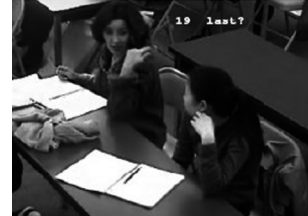
last? ((I points behind her))