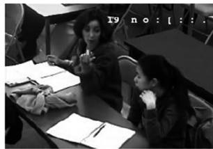
19 I: ⇒ n o : [ : : . . ((I points toward E))