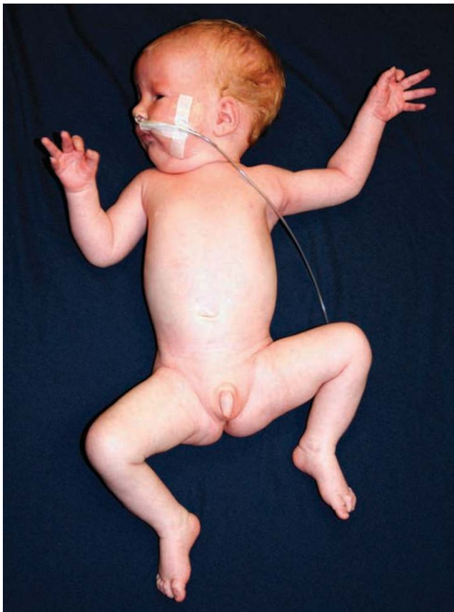
Figure 1 Hypotonia of infancy in a one-month-old male with PWS. Note frogleg position and need for a feeding tube. Also note dolichocephaly and hypoplastic, empty scrotum.

Hypotonia is prenatal in onset, and is usually manifested as decreased fetal movement, abnormal fetal position at delivery, and increased need for assisted delivery or cesarean section. In infancy (Figure 1), there is decreased movement and lethargy with decreased spontaneous arousal, weak cry, and poor reflexes, including a poor suck that leads to early feeding difficulties and poor weight gain. Deep tendon reflexes are often spared. Assisted feeding through a feeding tube and/or special nipples with increased feeding times are invariably necessary. The hypotonia is central in origin. Mild-to-moderate hypotonia persists throughout life. Hypotonia is so characteristic that all newborns with unexplained persistent hypotonia should be tested for PWS. 1,2