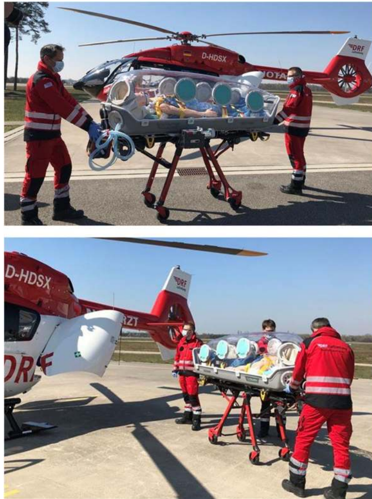
Fig. 2 The EpiShuttle® of the DRF-Luftrettung. The EpiShuttle is used only for interfacility transport. It is fitted into the helicopter (EC 145 / H 145) before the mission. The DRF-Luftrettung has an exemption according to article 71 (1) of regulation (EU) 2018/1139 by the “Luftfahrt-Bundesamt – LBA” (civil aeronautics board of Germany) to use the EpiShuttle in the Eurocopter 145 and Airbus Helicopter 145 rotor wing aircrafts of the company

The majority of patients treated needed medical interventions during the missions. Table 1 summarises some of the typical emergency and intensive care interventions. Patients who needed to be transferred to a higher-level medical facility (mainly interfacility transport) were more severely ill and needed significantly more mission-related interventions, except fluid therapy. Non-invasive ventilation (NIV), lung ultrasound and CPR—including ACCD—was used significantly more often in primary missions. During interfacility transport, ECMO was vital to ensure sufficient oxygenation in 14 patients (5.3%).