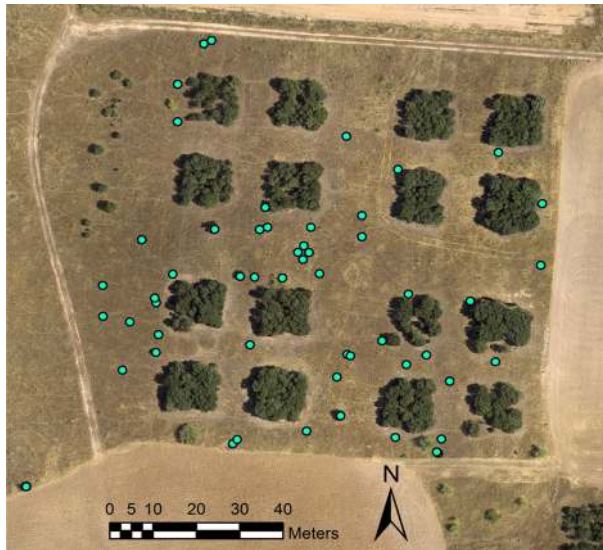
Fig. 4 Position of the 58 naturally established oaks >1 year old in the experimental field

( \chi^2_3 = 1.81 , p = 0.77 ) or distance ( \chi^2_4 = 2.97 , p = 0.56 ) according to the survival analysis. Mean distance of surviving and dead seedlings to islets was 3.0 \pm 3.0 and 4.6 \pm 2.5 m, respectively (differences in these distances were not significant, t test p = 0.15 ). Density distribution of emerged seedlings that survived after first dry season did not differ among distance bands ( \chi^2_5 = 7.92 , p = 0.16 ). Thirty per cent of dead seedlings dried out, 35 % were predated when they were alive and 15 % once dry, and for the remaining 20 % dead seedlings we could not conclude the cause of death.