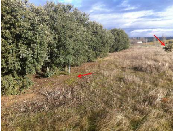
Fig. 1 In our 21-year-old experiment, it is noticeable that the planted islets have increased in volume, exported acorns and produced new established oaks (e.g. the one with red arrow to the right of the figure) but are confined to the original planted surface. Also note the area with minimal herbaceous vegetation immediately outside the islets edge ( red arrow in the centre of the figure)

In this study we assessed several demographic processes affecting early seedling recruitment around the woodland islets based on field experiments and long-term recruitment based on field observations. We hypothesized that biotic limitations (primarily acorn and seedling predation), and stressful microclimatic conditions (primarily water stress) would explain overall observed low initial natural regeneration in this system. It was difficult to predict the effect of distance to the islets on long-term oak establishment as a result of two opposing effects, namely more abundant acorn rain and facilitation but also more intense competition from established oaks for water and nutrients, as well as intense rabbit herbivory close to the islets (Bartholomew 1970). We expected high acorn predation for unprotected acorns (H1), highest seedling emergence and survival at the northern-oriented edges of the islets due to micro-climate amelioration by islet canopy (H2), and high predation of unprotected oak seedlings (H3). Results from this study will be particularly useful to practitioners and land use planners of woodland restoration projects in agricultural landscapes.