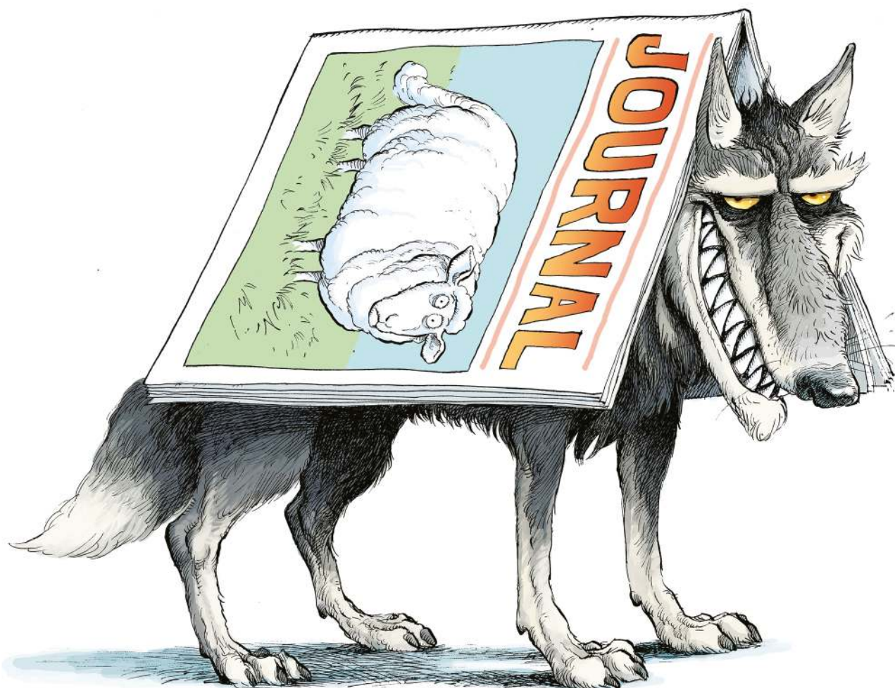
ILLUSTRATION BY DAVID PARKINS