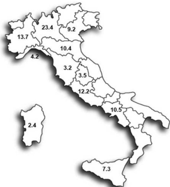
Figure 1 Percentage distribution of patients throughout Italy.