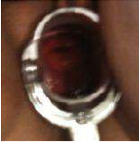
FIGURE 1: Cervical position at 12 months postpartum.