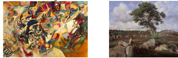
Figure 1: Composition VII, 1913 - Wassily Kandinsky (left), The Raging One, c.1830 - Camille Corot (right), two sample artworks belonging to abstractionism and realism respectively, the two art styles considered for initial experimental tests.

However, through the expert interview process, more parameters would be identified and used for the evaluation of the sonification algorithm and its successive iterations.