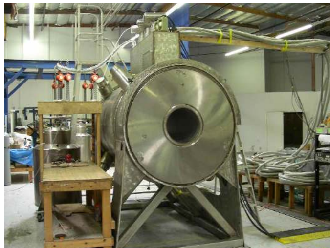
Fig. 3. Finished Spectrometer Solenoid 1 before the Magnet Cool-down

Laboratory in the UK a bit easier. The problem with the use of drop in coolers is that from 0.2 to 0.3 W of cooling is lost when the cooler is installed in a drop-in cooler sleeve at the top of the magnet cryostat [12]. With three coolers installed on the magnet, the effective available cooling power at 4.2 K is from 3.6 to 3.9 W instead of 4.5 W.