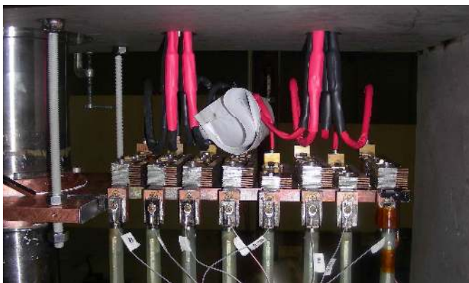
Fig. 2. The HTS and Copper Leads for the MICE Spectrometer Solenoid

* This change is at the coil maximum design current, which is based on the worst-case currents for the five coils.