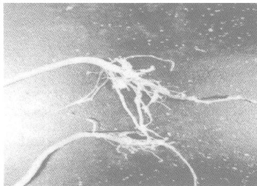
Figure 3. The upper is the best homemade formula sample, the under one is the traditional seed coating agent samples.

peptide containing phenolic compounds, increase the synthesis rate of phenylalanine. In sixth days after seed germination, the enzyme activity can be increased by 1.2 to 1.7 times than that of the untreated one, which greatly promoted the growth of soybean.