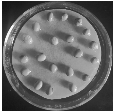
Figure 1. Seed coating treatment on soybean seed.