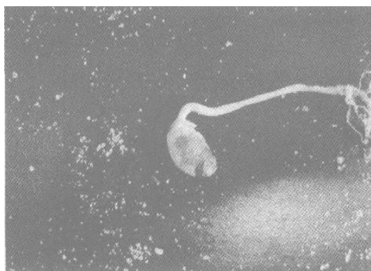
Figure 4. The diseased soybean blank samples.