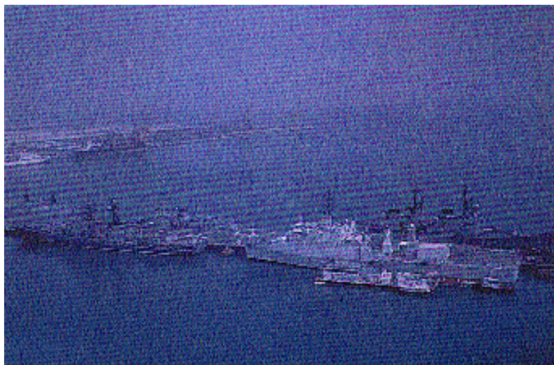
U.S. Navy (April-Hatton)