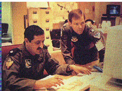
Coalition forces conducting daily situation evaluations during Desert Storm.