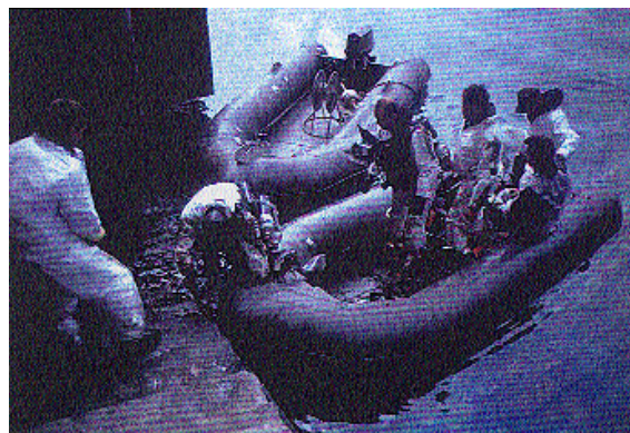
British explosive ordnance unit providing security in Kuwait Harbor.

The responsibility for logistical support in ad hoc coalitions is best retained by each nation. Key transport facilities and host nation support (such as water and petroleum, oil, and lubricants) should be coordinated by a multinational combined staff. Policies relating to medical treatment and evacuation of casualties are also best left to individual national forces.