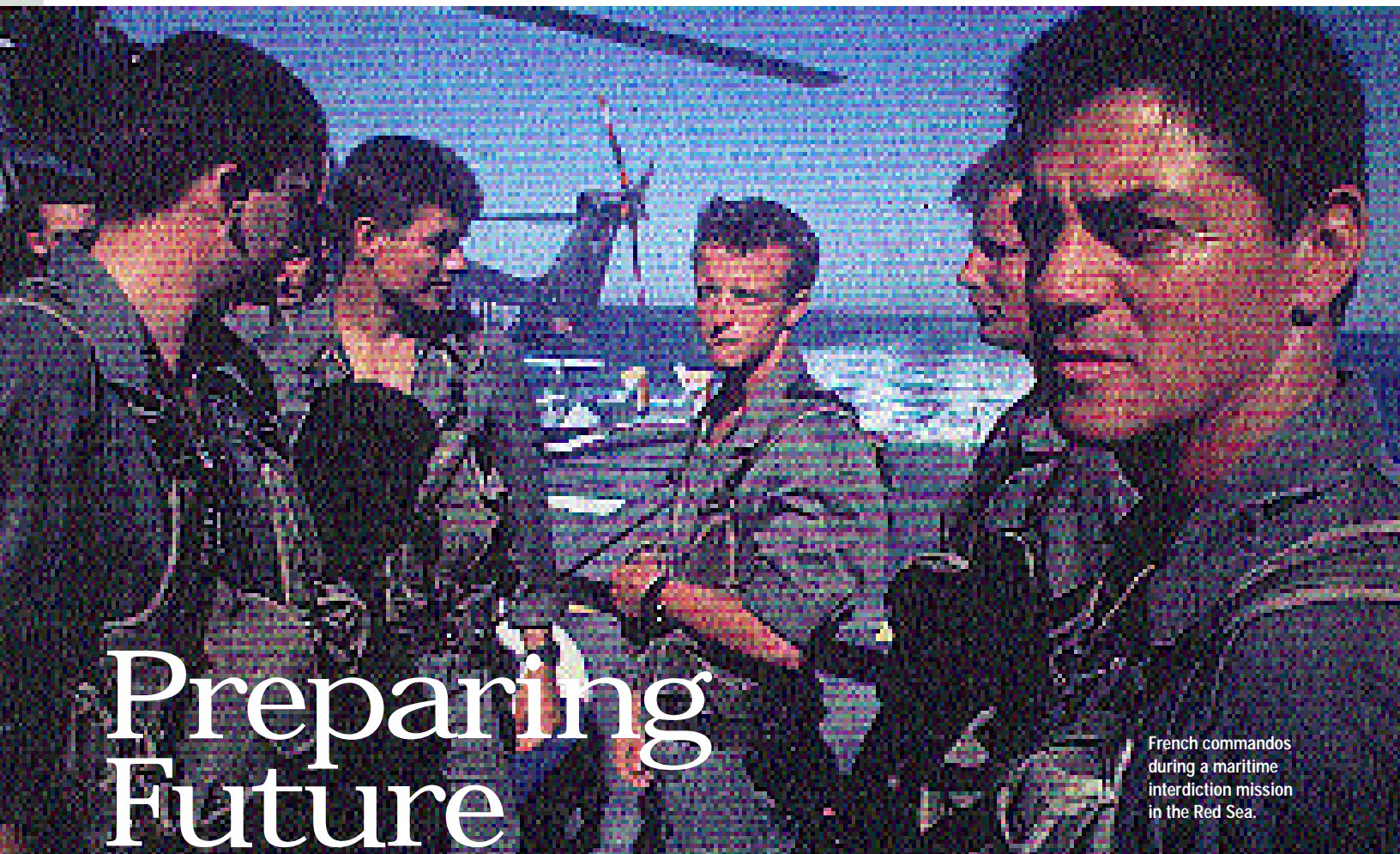
French commandos during a maritime interdiction mission in the Red Sea.