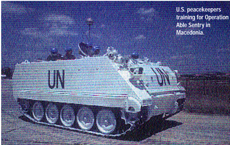
U.S. peacekeepers training for Operation Able Sentry in Macedonia.