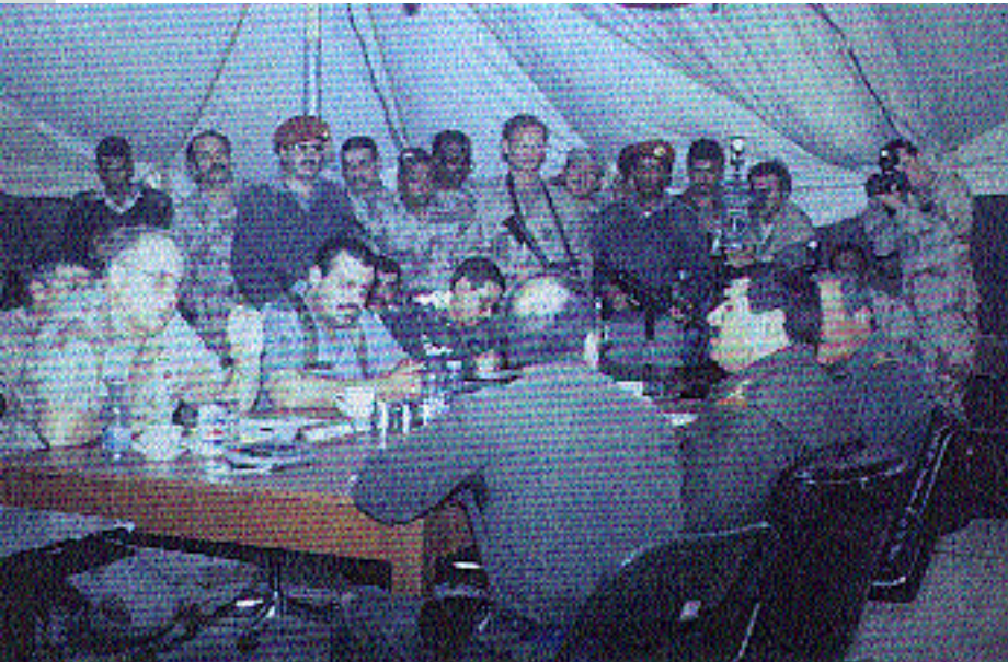
Coalition commanders discussing cease-fire terms with Iraqis on March 3, 1991.