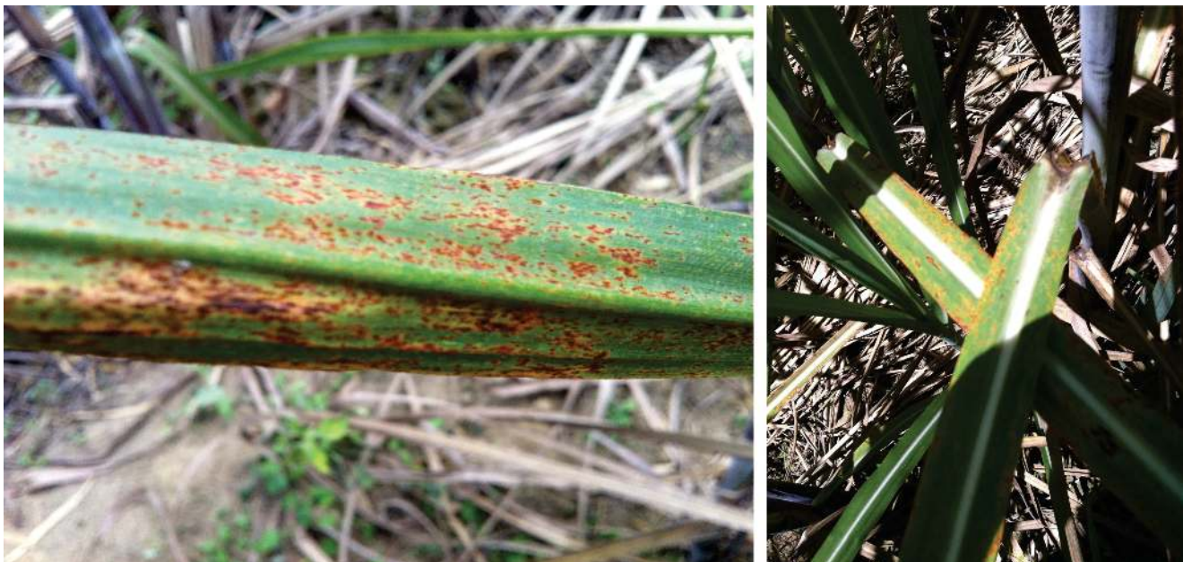
FIGURE 1 - Symptoms of orange rust ( Puccinia kuenhii ) in sugarcane leaves of the RBUFRPE0032 genotype. Leaf rust pustules present in the middle third and bottom of the leaves, observed in the experimental field in Goiana, PE, March 2012.

Symptomatic leaves were collected and taken to the Plant Pathology Laboratory of the Sugarcane Experimental Station. Characterization of fungal structures under the optical microscope showed yellowish to light brown ovoid spores presenting equatorial pores and thicker wall at the apical region, reaching 11.5 micrometers (Figure 2), characteristic features of P. kuenhii described by Hsieh & Fang (1983) and by Cruz et al. (2012) when diagnosing this disease in Rio Grande do Norte state. A detailed official document reporting the event was sent to Superintendence of the Agriculture Department of Pernambuco for notification