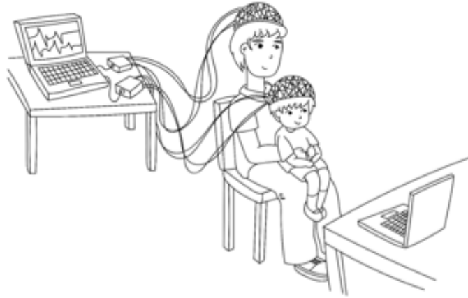
Figure 1. Experimental set-up and seating arrangement of father-child dyad. Figure illustrated by Farouq Azizan.