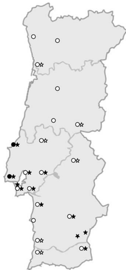
Fig. 1 Distribution of Ophelimus maskelli in Portugal in 2007, based on the presence of typical leaf galls in two Eucalyptus species: (closed stars) E. camaldulensis with galls; (open stars) E. camaldulensis with no signs of galls; (closed dots) E. globulus with galls; (open dots) E. globulus with no signs of galls

The susceptibility of the two Eucalyptus species to O. maskelli was evaluated also based on gall size. A sample of 30 galls per each tree species was collected from different leaves and their diameter was measured. Differences between plant species were compared by using a t -test on untransformed data.