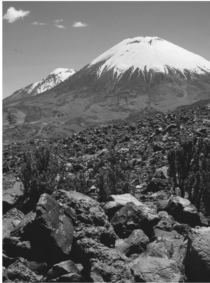
FIGURE 3 Volcán Ponerape (6240 m, left) and Volcán Parinacota (6342 m, right) tower over rocky lava ridges with stands of Polylepis tarapacana growing with Parastrephia lucida and Azorella compacta .

The biogeographic affinities represented in the flora of Lauca National Park and adjacent areas of Parinacota Province show differing patterns between zonal and wetland floras. The flora of zonal habitats of the prepuna and puna show stronger floristic links to a regional puna flora extending from southern Peru and western Bolivia into northern Chile and Argentina. This puna flora in the Andean puna habitats of northern Chile is markedly distinct from that of the Andean flora characteristic of the central and south-central Andes, where winter rainfall regimes exist (Arroyo et al 1988). There is a stronger floristic similarity, however, between the puna wetland flora of northern Chile and the Andean wetland flora of central and southern Chile, and little local endemism is present in this group (Arroyo et al 1982, 1988; Ruthsatz 1993).