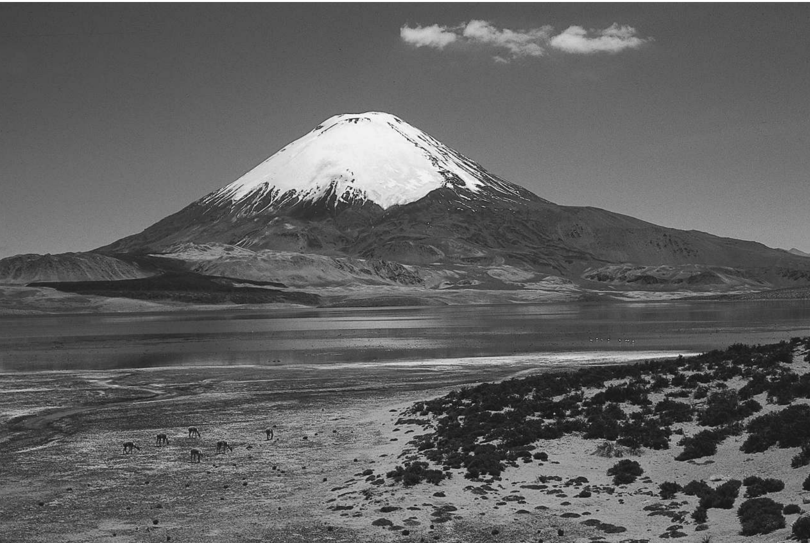
FIGURE 2 Volcán Parinacota (6342 m) with Lago Chungará, the highest elevation lake in the world, at its base. In the right foreground are dwarf woodlands dominated by Polylepis tarapacana , and the left foreground shows wetland habitats termed bofedales with grazing vicuñas.

The relatively gentle topography within the Lauca Basin averages about 4100 m in altitude, giving it an elevation about 500 m higher than Lago Titicaca. Geological evidence and climate indicators such as pollen, evaporites, and sedimentary facies indicate that an arid climate has existed in the Lauca Basin over the past 6.2 million years (Kött et al 1995; Gaupp et al 1999).