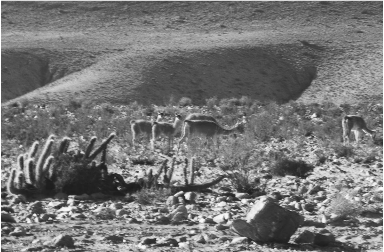
FIGURE 6 Grazing guanacos in pre-puna shrubland about 30 km southwest of Putre, outside of Lauca National Park. This habitat is poorly represented within the park.

leading to the creation of Las Vicuñas National Reserve adjacent to Lauca as an area where more active management can take place. Careful consideration is now being given to how herds of vicunas can be managed so that an industry can be developed by indigenous populations to harvest valuable vicuña fur in a sustainable manner and without violating the restrictions of CITES for this endangered species. Management and protection of Andean huemul, guanacos, and a variety of rare plant species in prepuna habitats can best be implemented by adding larger areas of these habitats to the existing park (Figure 6). This issue is discussed in more detail below.