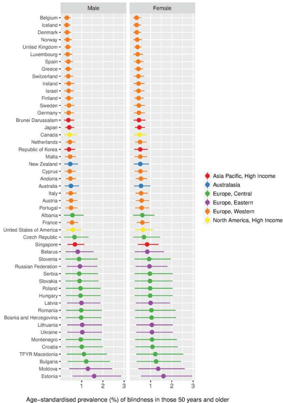
Figure 1 Ladder plot showing the age-standardised prevalence of blindness in men and women aged 50+ years for 2015. These are modelled estimates using prevalence figures applied to the individual populations of countries (point estimates with 80% uncertainty intervals are displayed).

4 causes remained constant in 2015 (table 5c) and by 2020 (table 5d).