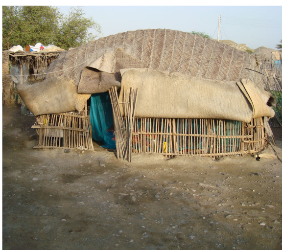
Fig. 1 Sheds made of palm leaves, a living place for people in Bashagard County, southeast of Iran

Students of study villages and their family were informed about the objectives and procedures of the investigation. The parents signed a consent form and the students